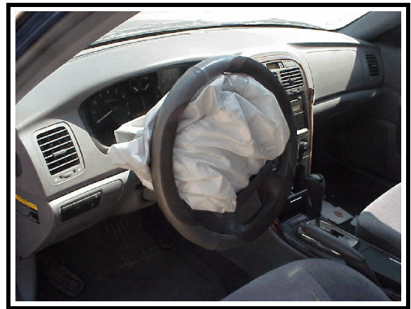
Figure 4. Driver's air bag

The photograph showed the deployed steering wheel mounted air bag, but it had been folded and tucked underneath the steering wheel rim. Therefore, the fabric could not be inspected for signs of failures and occupant contact points.