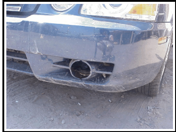
Figure 1. Front left bumper, 2004 Kia Optima

This remote investigation focused on the interaction between the driver and the driver's air bag. The case was initially investigated as an air bag related serious injury case and then changed to a redesigned air bag investigation. The highest air bag related Abbreviated Injury Scale (AIS) injury was not considered severe enough to be considered an air bag related serious injury. The case vehicle was a 2004 Kia Optima that was traveling eastbound on a two lane, divided interstate highway. The Kia was occupied by a 42-year-old female (155 cm-61 in/73 kg-160 lbs). A non-contact vehicle encroached into the passing lane, directly in front of the case vehicle. The driver of the case vehicle steered left and successfully