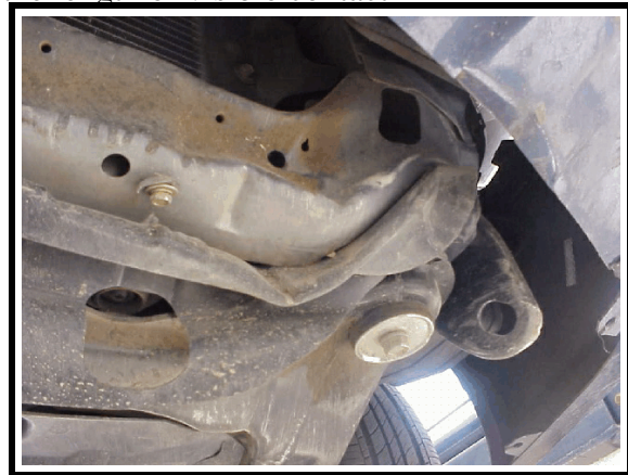
Figure 3. Close up of contact to radiator support