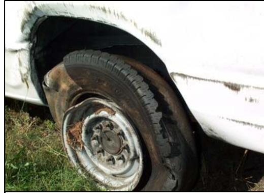
Figure 12 - Left rear tire transfers onto wheel opening.