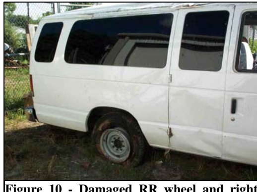
Figure 10 - Damaged RR wheel and right side of Ford E-350.