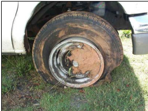
Figure 9 - Damaged RF wheel.

The right side also sustained minor damage beginning near the forward aspect of the fender and extending rearward to the back aspect of the right rear door. The second and third right side windows were shattered during the crash. Both right side tires were deflated and grass and dirt was embedded into the wheel rims ( Figures 9 – 10 ).