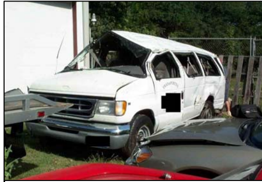
Figure 8 - Damaged 2002 Ford E-350 Van.

The 2002 Ford E-350 sustained moderate damage to its roof and minor damage to its left and right sides due to the rollover ( Figure 8 ). Precise measurements were not available for this SCI remote investigation. Based on police provided images of the vehicle’s exterior, the maximum crush on the vehicle’s roof was located at the left A-pillar. The A-pillar was deformed rearward and downward and the roof crushed vertically approximately 13 cm (5”). The midline of the roof buckled resulting in a near complete separation of the windshield. The entire left roof side rail was slightly crushed downward. The Collision Deformation Classification (CDC) for this impact was 00-TDDO-3.