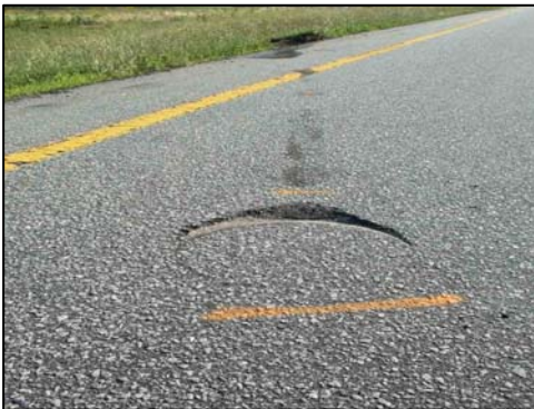
Figure 6 - Gouge from left rear wheel rim.