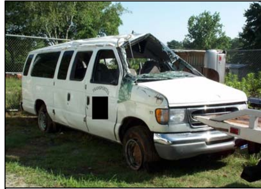
Figure 1 - Damaged 2002 Ford E-350

This remote investigation focused on the cause and severity of a rollover of a 2002 Ford E-350 Super Duty 15-passenger van ( Figure 1 ). The Ford was utilized as a business transportation van and was en-route to Springfield, Virginia from Houston, Texas. The Ford was operated by a 32-year old male driver and occupied by another rotating driver seated in the front right position and 11 paid adult passengers seated in rows 2-5. The driver and front right passenger were police reported as belted while the remaining rear seated passengers were unrestrained.