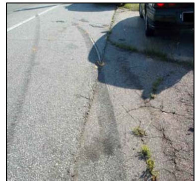
Figure 4 - Gouge on asphalt shoulder from right rear wheel.

It should be noted that this vehicle was traveling to Virginia from Texas and had already traveled a distance of 1,473 km (915 miles) to this point. The estimated time to travel this distance was approximately 14 hours according to the Internet service site Mapquest .