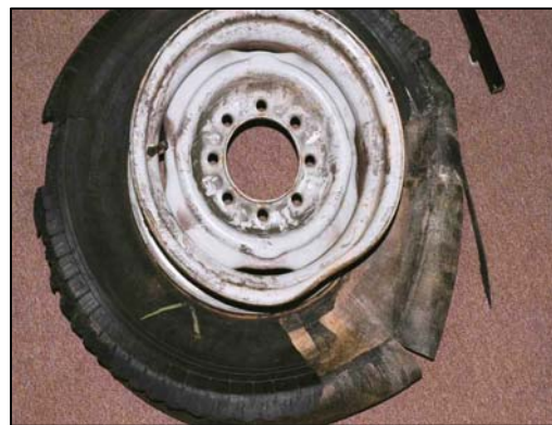
Figure 7 - Correlative damage on wheel rim.