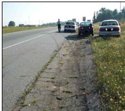
Figure 3 - Vehicle reenters roadway while yawing CCW.