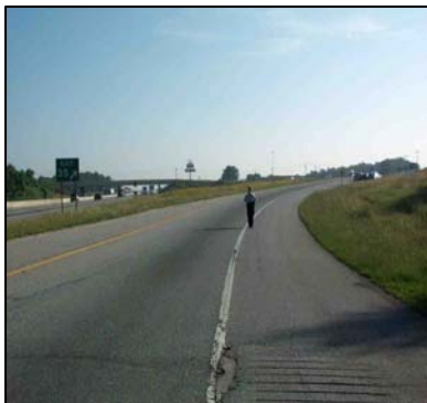
Figure 2 - 2002 Ford departs right roadside.