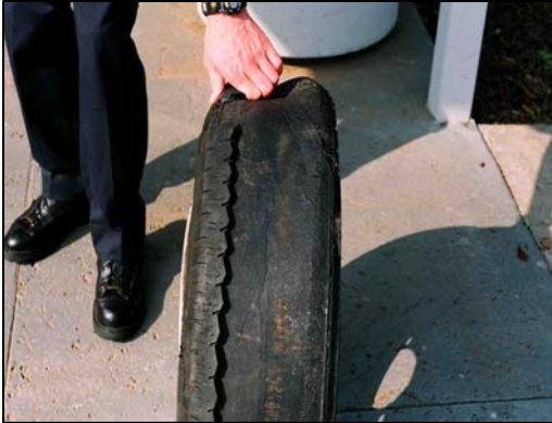
Figure 11 – Left rear tread separation.

the third quarter-turn of the rollover. The general condition of the left rear tread appeared to be satisfactory prior to the crash and the PAR noted its condition as good. Additional damage to the left tire included tears in the sidewall and multiple abrasions. Positioning the tire with the valve stem representing 12 o'clock, a tear was present in the sidewall at 3 o'clock and another at 10 o'clock. A large section of the tread separated; however, exact measurements could not be determined.