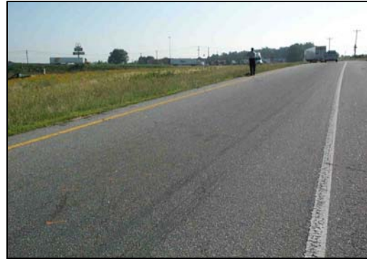
Figure 5 - Area of initial rollover.

The van began to overturn right side leading at approximately the inboard edge of the right shoulder on the one-lane exit ramp. Gouges associated with the rollover were present in the travel lane ( Figure 5 ). The vehicle continued to overturn on the roadway and as the vehicle entered its third quarter turn, the left rear wheel contacted the asphalt road surface ( Figure 6 ). A significant circular gouge was present at this location and correlative damage was present on the left rear wheel rim ( Figure 7 ). The vehicle continued overturning and departed the north roadside and came to final rest after a total of nine-quarter turns. The vehicle traveled approximately 45 m (150') during the rollover event before coming to rest on its right side approximately 8 m (25') outboard of the left (north) shoulder. During the course of the rollover, two occupants were ejected from the vehicle through the second row left window opening and killed. It was unknown where the ejected victims came to rest, although the police did indicate they were not trapped under the vehicle.