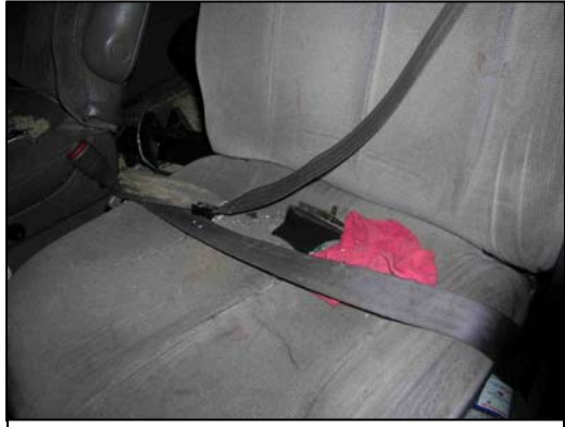
Figure 14 - Driver's 3-point lap and shoulder restraint.

emergency personnel to remove the driver from the vehicle ( Figure 14 ). The webbing of the