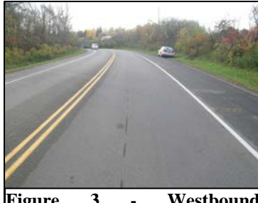
Figure 3 Westbound approach of Chevrolet K-1500.