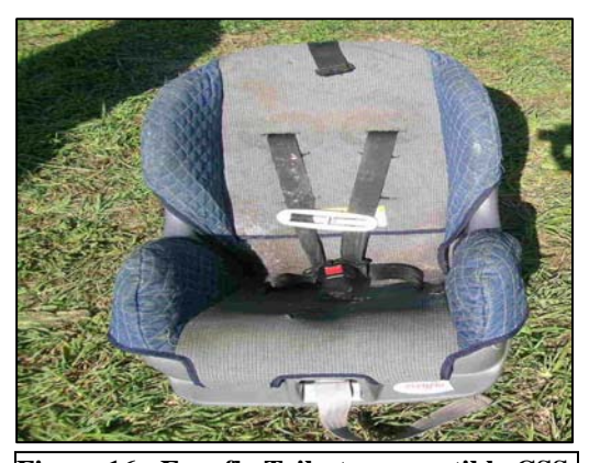
Figure 16 - Evenflo Tribute convertible CSS.