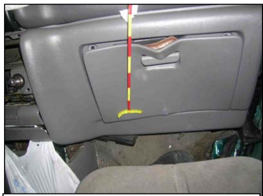
Figure 10 - Left knee contact evidence on front right glove compartment door.

knee contact ( Figure 11 ) was located 25 cm (9.8") inboard and 14 cm (5.5") above the bottom aspect. Both contacts were linear and measured approximately 5 cm (2").