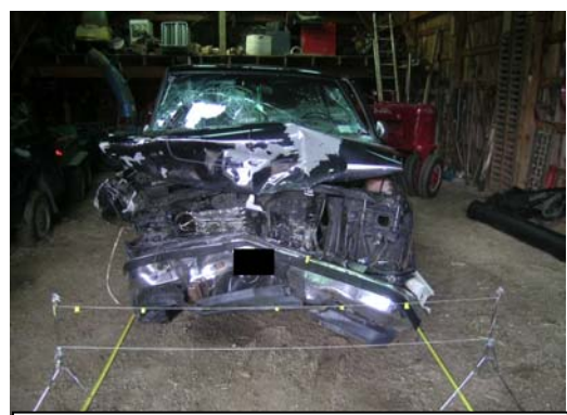
Figure 13 - Crush profile of 1993 Chevrolet K-1500.

As a result of the impact, the front right door of the Chevrolet was jammed shut and the front right window disintegrated. The front right tire was cut and restricted by the crushed front right bumper. The front right axle position was deformed rearward compressing the wheelbase 29 cm (11.4"). The bed of the Chevrolet contained an industrial tool box weighing an estimated of 91 kg (200 lbs.) at the time of the inspection. At impact, the tool box engaged the bed of the pickup resulting in minor damage.