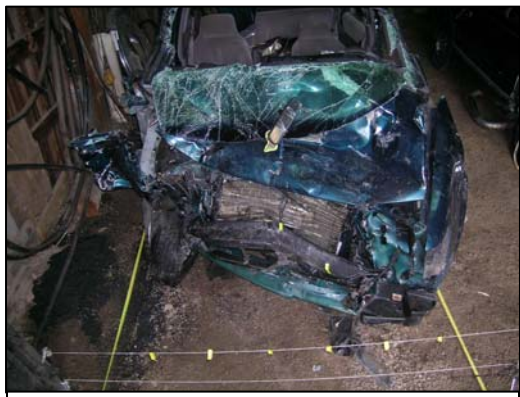
Figure 5 - Crush profile of 1994 Plymouth Voyager.

The 1994 Plymouth Voyager sustained severe frontal damage as a result of the impact with the Chevrolet ( Figure 5 ). The direct contact damage began 29 cm (11.6") left of the vehicle's centerline and extended 80 cm (31.5") to the front right bumper corner. The combined direct and induced damage encompassed the entire width of the bumper beam and measured 113 cm (44.5"). The maximum crush was located at the front right bumper corner and measured 84 cm (33.1") in depth. The crush profile consisted of six equidistant crush measurements taken along the bumper beam and was as follows: C1 = 12 cm (4.7"). C2 = 50 cm