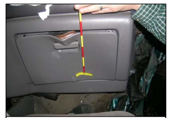
Figure 11 - Right knee contact evidence on glove compartment door.

The toe pan in the driver's and front right positions and the front right instrument panel intruded longitudinally. The front right floor pan intruded vertically. It is likely that the lower extremities of both front seat occupants loaded the toe pan area; however, no discernable contact evidence could be identified.