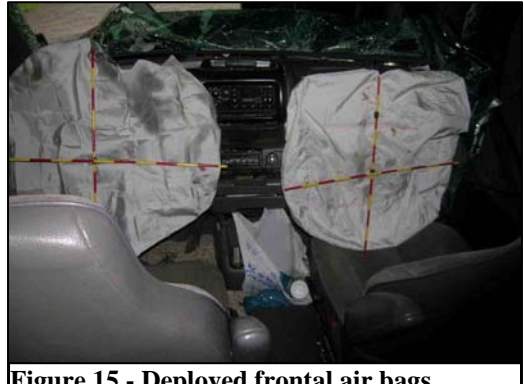
Figure 15 - Deployed frontal air bags.

The 1994 Plymouth Voyager was equipped with frontal air bags for the driver and front right passenger positions (Figure 15). The driver's air bag was housed in the center of the steering wheel hub. The driver's air bag deployed from the steering wheel hub through symmetrical Hconfiguration module cover flaps. The cover flaps measured 18 cm (7") in width and 6 cm (2.5") in height. The driver's air bag measured 56 cm (22") in its deflated state and had an excursion of 33 cm (13"). The air bag was vented by two circular ports located in the 11