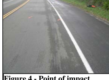
Figure 4 - Point of impact.