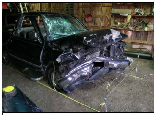
Figure 12 - Damaged 1993 Chevrolet K-1500.

corner and measured 82 cm (32.3") in depth. The crush profile was measured along the damaged bumper and was as follows: C1 = 5 cm (2"), C2 = 28 cm (11"), C3 = 51 cm (20.1"), C4 = 69 cm (27.2"), C5 = 81 cm (31.9"), C6 = 82 cm (32.3"). The CDC for the impact with the Plymouth was 12-FDEW-4.