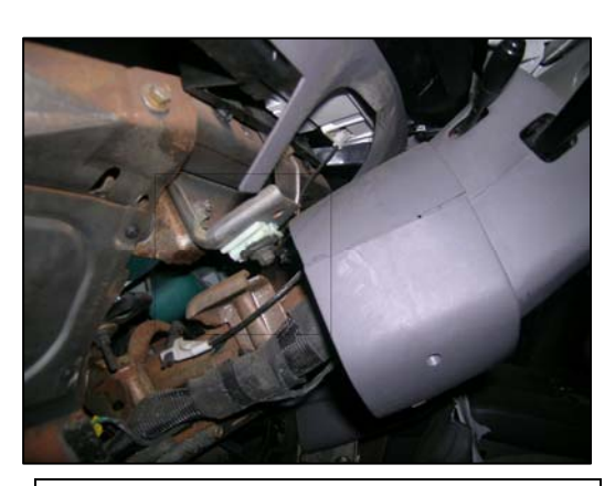
Figure 9 – Left shear capsule separation.

The right side knee bolster exhibited well-defined deformation from contact with the knees of the 19-year old male seated in the front right position. The deformation bowed the glove compartment door and was located inboard of the outer right edge and above the bottom edge of the instrument panel in two locations. The left knee contact ( Figure 10 ) was located 44 cm (17.3") inboard and 11 cm (4.3") above the panel and the right