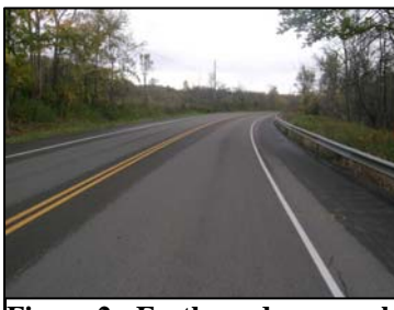
Figure 2 - Eastbound approach of Plymouth Voyager.

The 50-year old female driver of the Plymouth Voyager was traveling in an easterly direction on a two-lane roadway negotiating a right curve (Figure 2). According to a witness the vehicle was driving erratically weaving in out of the eastbound lane. As the Plymouth was negotiating the curve it entered the westbound lane and impacted a 1993 Chevrolet K-1500 pickup truck that was westbound on the same roadway (Figure 3). The 43-year old male driver of the Chevrolet applied and locked up his brakes prior to the impact evidenced by a 6.9 m (22.6') long skid mark from the front right tire. Roadway gouging was also present at the point of impact (Figure 4).