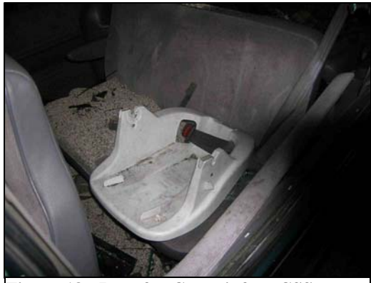
Figure 18 - Base for Cosco infant CSS.

3340. No information was available on the model name or the date of manufacture. The base was 53 cm (20.75") in length and 36 cm (14") in width. It was secured in the vehicle by a manual 3-point lap and shoulder belt with a cinching latch plate. The base had a side-to-side excursion of approximately 5 cm (2") there was minor rippling to the belt. The base was not used during the crash. The occupancy status of the second row left seating position was confirmed through a surrogate interview.