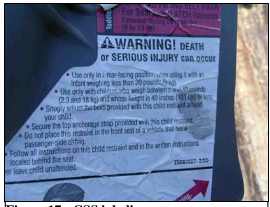
Figure 17 - CSS labeling.

At the time of the CSS inspection, the harness straps were routed through the top slots consistent with forward facing use. The harness retainer clip was positioned 24 cm (9.5") below the harness slots. There left harness webbing exhibited loading evidence located 32 cm (12.5") below the harness slots where the webbing was roped within the left latch plate. There were no discernable stress marks on the seat or shell of the CSS.