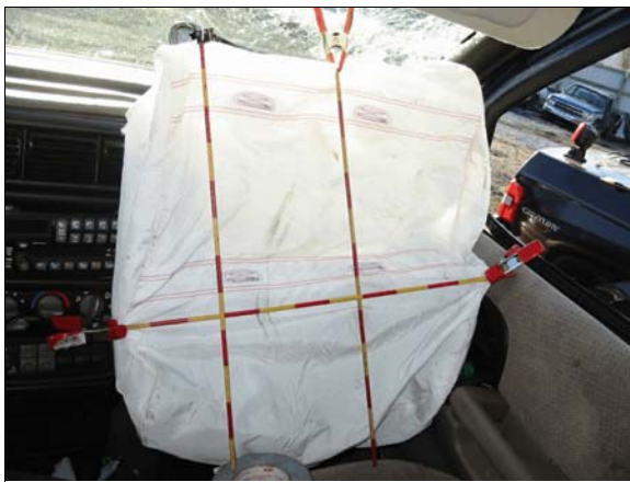
Figure 12: Overview of case vehicle's front right passenger air bag