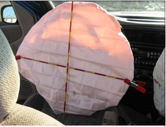
Figure 11: Case vehicle driver's air bag

The front right passenger's air bag was located in the top of the instrument panel. An inspection of the air bag module cover flap revealed that the cover flap opened at the designated tear points. The cover flap was bent during the deployment. There were numerous small holes in the air bag due to contact by flying glass during the crash. In addition, there was a small tear in the top of the air bag, which was most likely due to contact with the broken windshield glass. The windshield was fractured due to the right side impact as well as contact by the air bag as it deployed. The deployed front right passenger air bag (Figure 12) was rectangular in shape and was approximately 66 centimeters (26 inches) in height and 54 centimeters (21.3 inches) in width. The air bag was designed with four tethers, each 8 centimeters (3.1 inches) in width. There were two vent ports, each 3 centimeters in diameter located on each side of the air bag at the approximate 10 and 2 o'clock positions. Inspection of the air bag revealed a few blood stains due to blood splatter