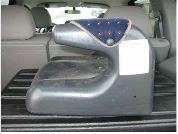
Figure 15: Left side view of no-back belt-positioning booster seat