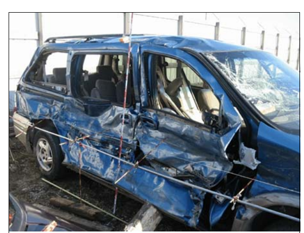
Figure 5: Damage to right side of case vehicle from impact by front of Freightliner, vertical scale increments in tenths of meter