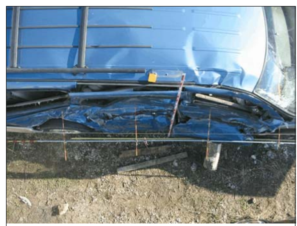
Figure 7: Top view of crush to right side of case vehicle's passenger compartment due to Freightliner's front impact, each increment on rods is 5 cm (2 in)

The case vehicle's recommended tire size was P215/70R15, and the case vehicle was equipped with tires of this size. The case vehicle's tire data are shown in the table below.