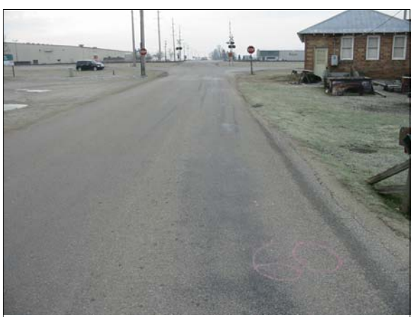
Figure 2: Approach of Freightliner southbound to intersection, number on roadway shows meters to impact area