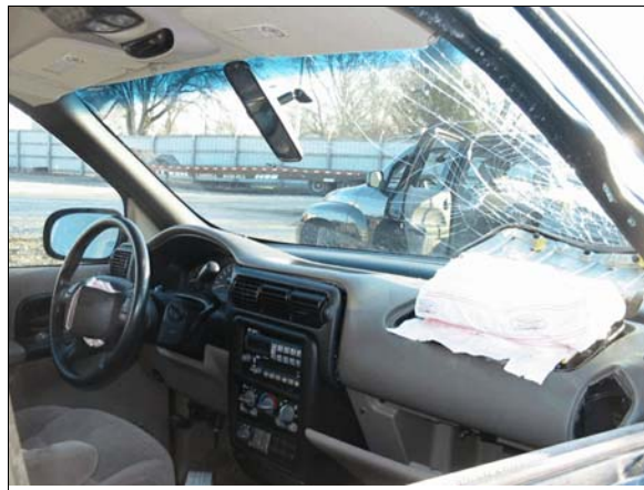
Figure 8: Overview of case vehicle's instrument panel, windshield and steering wheel

The case vehicle was equipped with a next generation driver and front right passenger front air bag system as well as front seat back-mounted side impact air bags. Both front air bags and the front right passenger seat back mounted side