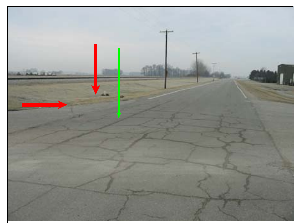
Figure 3: Overview of impact area (green arrow) from case vehicle's approach, and case vehicle's post-impact travel to rollover and final rest (red arrows)