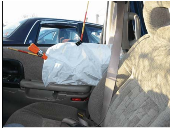
Figure 13: Case vehicle front right passenger's seat back-mounted side impact air bag

but no obvious occupant contact marks. In addition, there was a black scuff on the front and right side of the air bag, which appeared to be due to the deployment.