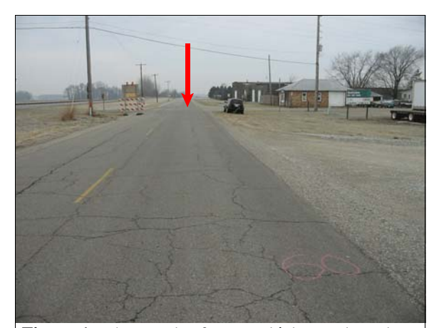
Figure 1: Approach of case vehicle westbound to area of impact (arrow), number on roadway shows meters to impact area

The 2000 Pontiac Montana was a front drive. wheel four-door minivan (VIN: 1GMDX03E3YD-----) equipped with a engine; four-speed 3.4L, V6 automatic transmission and four-wheel, anti-lock brakes. The front seating row was equipped with driver and front right passenger next generation air bags, seat back-mounted side impact air bags, bucket seats with adjustable head restraints; manual, three-point, lap-and-shoulder safety belt systems with buckle mounted pretensioners and a front