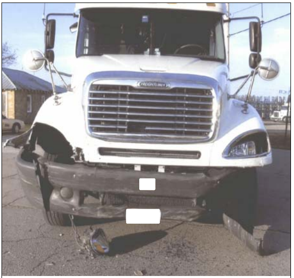
Figure 4: Sheriff department's on-scene photo of damage to front of Freightliner from impact with case vehicle

The direct damage due to the rollover involved the left quarter panel, right quarter panel, upper right corner of the tailgate, the right roof side rail and the right fender. It also overlapped the direct damage from the Freightliner impact to the right side in several places. In addition, the bead was broken on all the tires and grass was jammed in the bead of all the tires. No direct damage was observed to the roof indicating the roof cleared the ground or only contacted very lightly during the rollover.