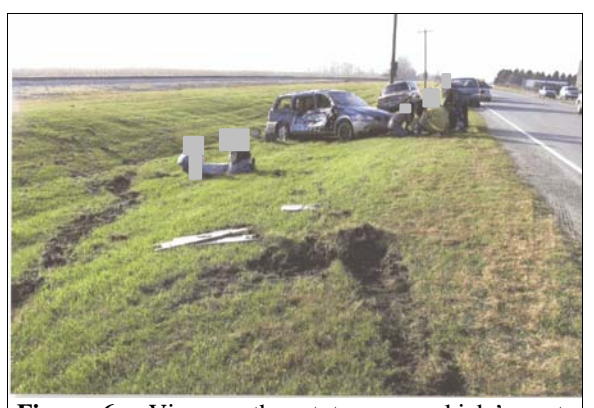
Figure 6: View southwest to case vehicle's rest position and tire furrows leading to rollover