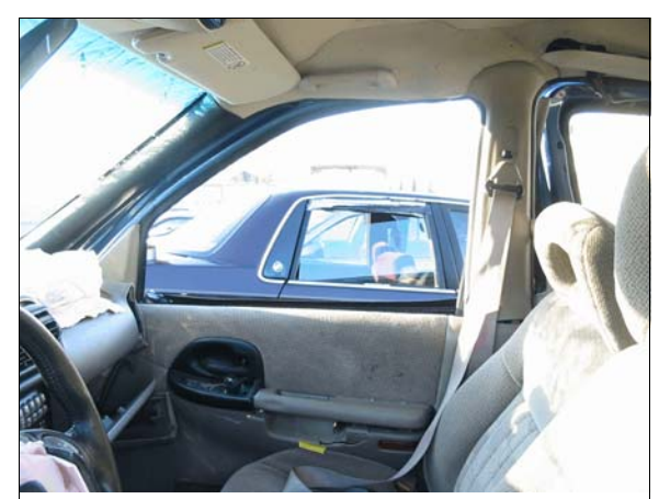
Figure 9: Overview case vehicle's right front door and front right seat