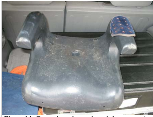
Figure 14: Front view of second seat left passenger's no-back belt-positioning booster seat

The type, make and model of the child safety seat used to restrain the second seat middle passenger is unknown. The child safety seat was not in the case vehicle at the time of the inspection and the tow facility personnel had no knowledge of its location. The sheriff and staff at the treating hospital were interviewed but no information regarding the type, make, model or location of the child safety seat could be determined.