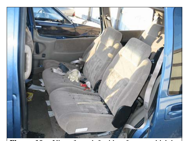
Figure 10: View from left side of case vehicle's second seat row

impact air bag deployed in this crash due to the right side impact.