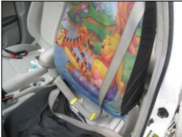
Figure 9. Driver's safety belt system.

of the webbing resulted in full width frictional abrasions on the latch plate. The shoulder belt webbing was gathered at the D-ring from a combination of the actuation of the pretensioner and loading by the driver. Also present on the webbing was body fluid and dirt that was located on the lap belt portion of the safety system. Figures 9 and 10 depict the driver's safety belt and loading evidence.