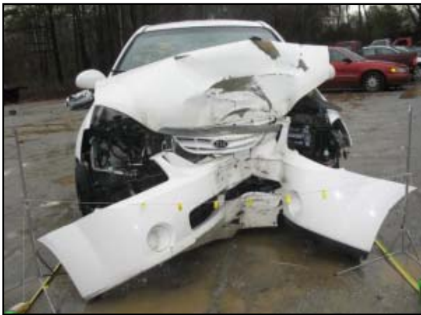
Figure 4. Overall view of the frontal crush of the Kia Spectra.

The 2006 Kia Spectra sustained moderate severity frontal damage as result of the crash with the pole. The direct contact damage on the bumper fascia began 18 cm (7") right of the vehicle's center line and extended 48 cm (19") to the left. The maximum crush was located on the bumper beam 13 cm (5") left of the vehicle's centerline and was 55 cm (21.5") in depth. The impact deformed the front bumper system to a U-shape resulting in a combined induced and direct contact damage length (Field L) of 83 cm (32.5"). Six equidistant crush measurements were documented along the bumper beam of the vehicle and were as follows: C1 = 24 cm (9.3"), C2 = 49 cm (19.3"), C3 = 55 cm (21.5"), C4 = 38 cm (14.8"), C5 = 22 cm (8.8"), C6 = 0 cm. Figures 4 and 5 are frontal and lateral views of the residual crush profile. The Collision Deformation Classification (CDC) for the pole impact was 12-FYEW-3. The crush was offset to the left which resulted in 5 cm (2") of compression of the left wheelbase and an elongation of the right wheelbase of 5 cm (2").