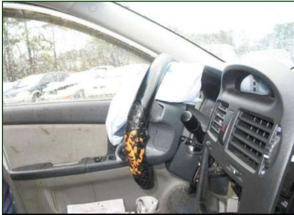
Figure 6. Lateral view of the bending to the lower steering wheel rim.

bolster from 11 cm to 23 cm (4" to 9") left of center. This contact fractured the adjacent mid instrument panel and contained a blue fabric transfer.