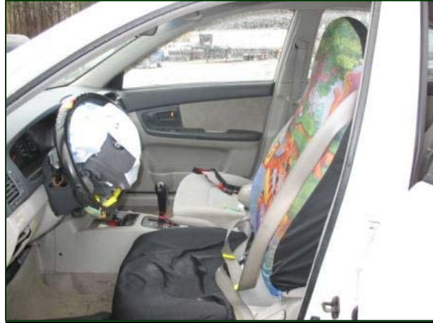
Figure 11. Lateral view of the driver's position and loading deformation of the steering wheel rim.

During the driver's forward trajectory, she loaded the child passenger and compressed the child against the lower steering wheel rim. The steering wheel rim was deformed forward at the lower aspect. Additionally, the steering column was compressed and steering wheel flange was deformed. Figure 11 is a lateral view of the driver position and loading of the steering wheel rim.