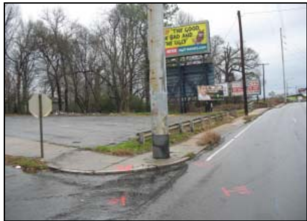
Figure 3. Northeast view of impact with the utility pole and final rest location of the Kia.

The Kia departed the northeast quadrant of the intersection. The left front tire mounted the barrier curb as the left front area engaged the 51 cm (20") diameter steel utility pole ( Figure 3 ). The resultant direction of force was 12 o'clock. The impact speed was computed by the damage and trajectory algorithm of the WINSMASH program at 37.0 km/h (22.9 mph). The vehicle crushed to a depth of 55 cm (21.5") that resulted in a damage algorithm calculated total delta-V of 37.0 km/h (22.9 mph). The longitudinal and lateral components were -37.0 km/h (-22.9 mph) and 0 km/h respectively. Due to the offset left impact, the Kia rotated approximately five degrees counterclockwise and came to rest partially engaged against the struck pole.