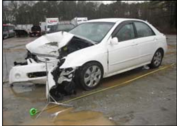
Figure 1. 2006 Kia Spectra.

This investigation focused on the Certified Advanced 208-Compliant (CAC) frontal air bag system, the fatal injury sources, and the cause of death for a 2-month-old female that was positioned on the lap of a restrained 20-year-old female driver in a 2006 Kia Spectra ( Figure 1 ). The Kia was equipped with a Certified Advanced 208-Compliant (CAC) frontal air bag system that included safety belt pretensioners with buckle switches, seat track positioning sensors, and a front right occupant presence sensor. In addition to the frontal air bag system, the Kia was equipped with front seat back mounted side impact air bags and inflatable curtain (IC) air bags for the four outboard seating positions.