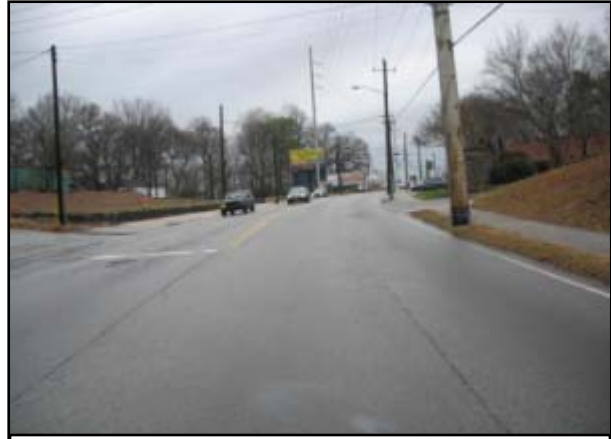
Figure 2. Pre-crash eastbound travel path of the Kia.

The driver of the Kia was operating the vehicle eastbound on the east/west roadway in an unknown travel lane ( Figure 2 ). The driver was operating the Kia with the 2-month-old female child passenger on her lap. A witness in a non-contact vehicle was traveling behind the Kia. As the driver of the Kia continued eastbound, she allowed the vehicle to drift to the left toward the southwest quadrant of the T-intersection. The witness stated that as the Kia approached the impending impact, the brake lights did not illuminate and the Kia was not traveling at a high rate of speed.