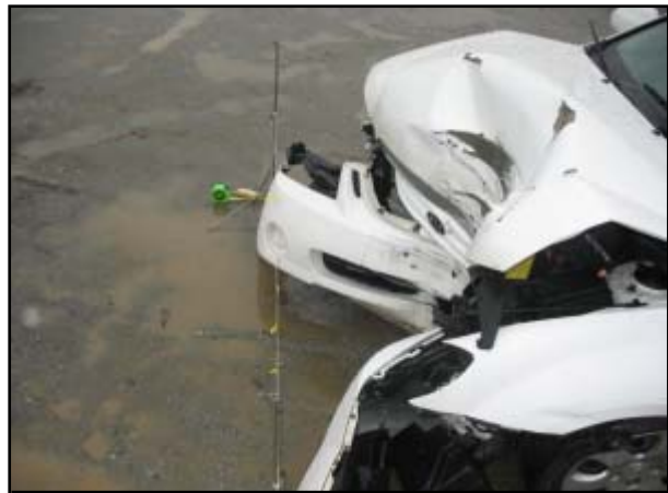
Figure 5. Lateral view of the crush to the frontal plane of the Kia Spectra.

All four doors remained closed during the crash and were operational post-crash. The laminated windshield was cracked vertically at the right aspect from the frontal deformation. An interior object impacted the windshield during the crash and produced two star-like fracture patterns. The door glazing was closed and intact and the backlight was not damaged.