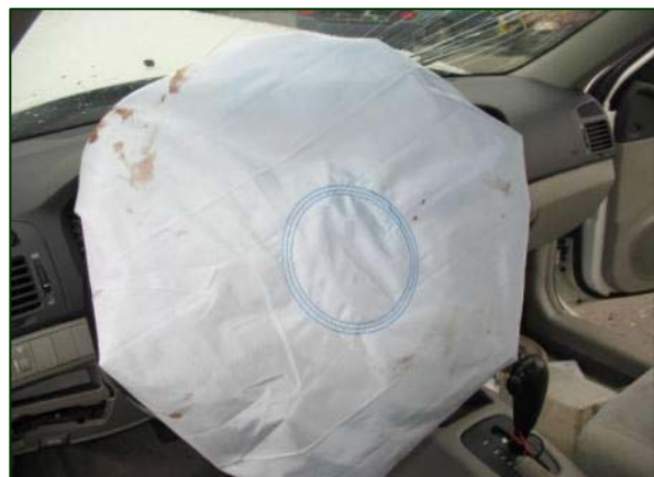
Figure 8. Deployed driver's CAC air bag.

The Kia Spectra was equipped with a Certified Advanced 208-Compliant (CAC) frontal air bag system that consisted of dual stage driver and front right passenger air bags, seat track positioning sensors, front seat retractor pretensioners, safety belt buckle switches and a front occupant presence detection (weight) sensor. The manufacturer of the Lexus has certified that this vehicle is compliant with the advanced air bag portion of the Federal Motor Vehicle Safety Standard (FMVSS) Number 208.