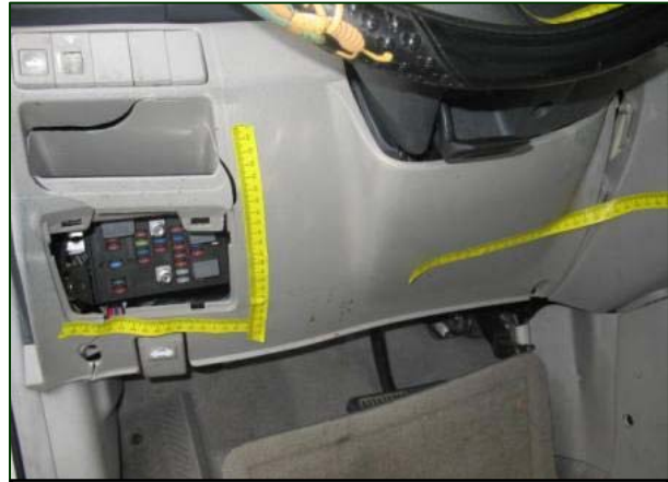
Figure 7. Knee contacts to the knee bolster/lower instrument panel.

Two star-like fractures were present on the right side of the windshield. These fractures were located 29 cm (11.4") and 30 cm (11.8") below the windshield header and 17 cm (6.7") and 14 cm (5.5") inboard of the right A-pillar. These fractures appeared to have occurred from an interior loose object. Also noted during the interior inspection, the gas pedal was missing from the pedal arm. This was probably dislodged from contact with the driver's right foot.