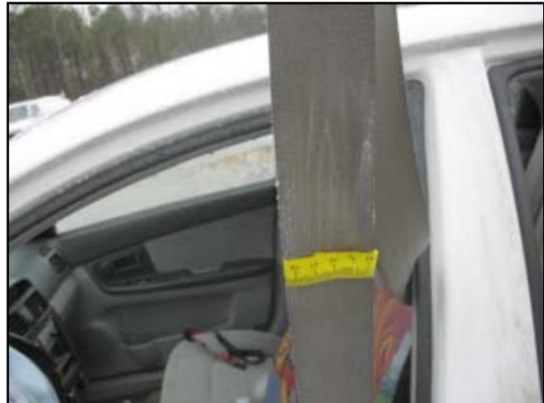
Figure 10. Loading abrasions from the latch plate.