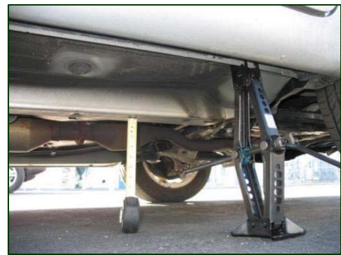
Figure 7. Full extended height under the exemplar vehicle.