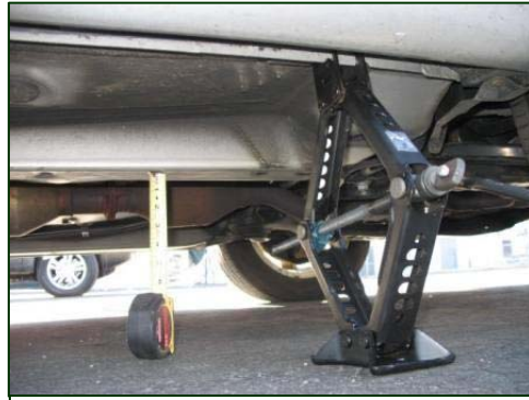
Figure 3. OEM jack positioned at proper jack point on the exemplar vehicle.

The victim retrieved the OEM jack from the trunk of the Toyota. He further stated to the SCI investigator that he had never used this jack before. He positioned the jack at the designated jacking point on the forward aspect of the right sill ( Figure 3 ). The victim jacked the Avalon to a height where the right front tire was off the concrete surface. None of the tires were removed from the vehicle. As he crawled under the Toyota, his wife handed him a flashlight that he grasped with his right hand. Almost immediately, and without touching the undercarriage of the Avalon, the victim heard a “cracking” noise and the vehicle rolled slightly rearward causing the jack to fall over and the vehicle to drop back onto the tires, compressing the right side suspension. The victim estimated that he was under the vehicle for approximately five seconds prior to the fall.