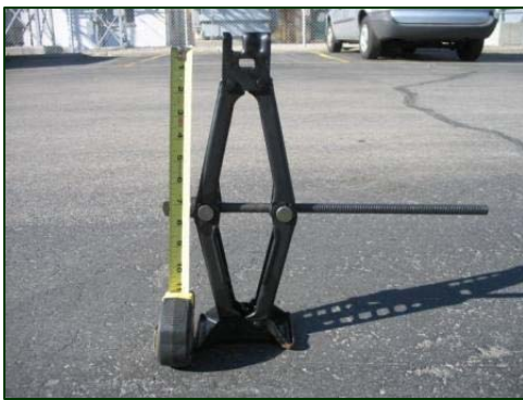
Figure 6. Full extended height of the exemplar jack.

The frame of the exemplar Toyota Avalon had a ground clearance height of 15 cm (6") with the vehicle resting on all four tires. The OEM jack was positioned at the designated jack point on the forward aspect of the right sill and the exemplar vehicle was raised to a point where the right front tire was approximately 3 cm (1") off the pavement. In this position, the ground clearance at the same location on the frame was (9.5"). The jack was raised to full height and the clearance increased to a maximum height of (11"). (Note: These exemplar measurements were obtained by jacking the exemplar vehicle on a level surface.) It should be noted that although the parking brake was set on the exemplar vehicle, the jack appeared to be unstable at this maximum height. Figures 6 and 7 are views of the exemplar jack fully extended.