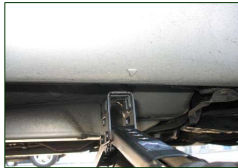
Figure 5. Proper jacking location on the right sill of the exemplar vehicle.

The frame of the exemplar Toyota Avalon had a ground clearance height of 15 cm (6") with the vehicle resting on all four tires. The OEM jack was positioned at the designated jack point on the forward aspect of the right sill and the exemplar vehicle was raised to a point where the right front tire was approximately 3 cm (1") off the pavement. In this position, the ground clearance at the same location on the frame was (9.5"). The jack was raised to full height and the clearance increased to a maximum height of (11"). (Note: These exemplar measurements were obtained by jacking the exemplar vehicle on a level surface.) It should be noted that although the parking brake was set on the exemplar vehicle, the jack appeared to be unstable at this maximum height. Figures 6 and 7 are views of the exemplar jack fully extended.