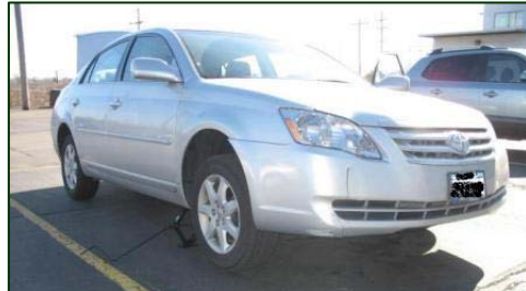
Figure 1. Overall view of an exemplar Toyota Avalon.

This remote investigation focused on the circumstances involved in a falling vehicle incident that resulted in moderate severity (AIS-2) injuries to a 44-year old male victim. The victim was attempting to inspect the undercarriage of his 2006 Toyota Avalon ( Figure 1 ) to determine the source of an oil leak when the vehicle rolled off the OEM jack causing the Toyota to fall onto the chest of the victim. The incident occurred at the victim's residence on a level concrete surface during daylight hours.