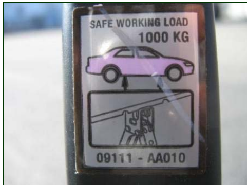
Figure 8. Safe Working Load of the exemplar jack.

Figures 8 and 9 are of the Warning labels on the OEM exemplar jack.