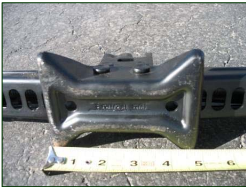
Figure 4. Base of the exemplar jack.

The exemplar OEM jack was a typical scissors-type jack with a center mounted jack-screw to raise and lower the saddle. The base of the jack ( Figure 4 ) was 9x12 cm (3.5x4.75"). With the jack properly positioned, the narrow width of the jack base was parallel to the wheelbase of the vehicle. The top saddle of the jack was U-shaped and engaged a designated cutout at the bottom of the sill. An arrow molded into the outer plastic sill panel identified the designated jacking point on the vehicle ( Figure 5 ). The jack had a maximum lifting height of 36 cm (14").