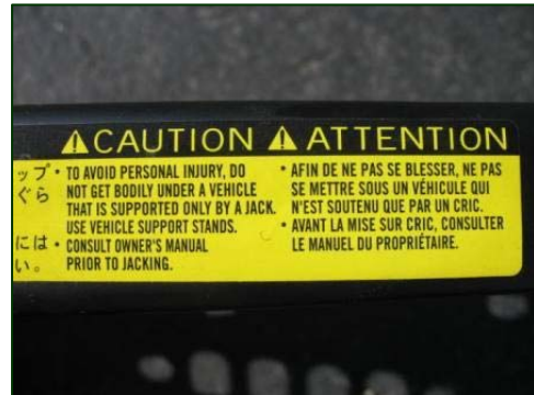
Figure 9. Caution label on the exemplar vehicle jack.