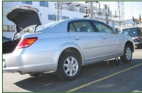
Figure 2. Exemplar Toyota Avalon.

The involved vehicle in this falling vehicle incident was a 2006 Toyota Avalon four-door sedan with the Touring Edition package. Figure 2 is a view of an exemplar Toyota Avalon. The vehicle was powered by a 3.5 liter V-6 engine linked to a five-speed automatic transmission with a console mounted shifter. The Toyota was designed on a front-wheel drive platform and had a specified weight of 1,615 kg (3,560 lbs). The Toyota was equipped with a P215/55R17 tires mounted on OEM alloy wheels. The victim