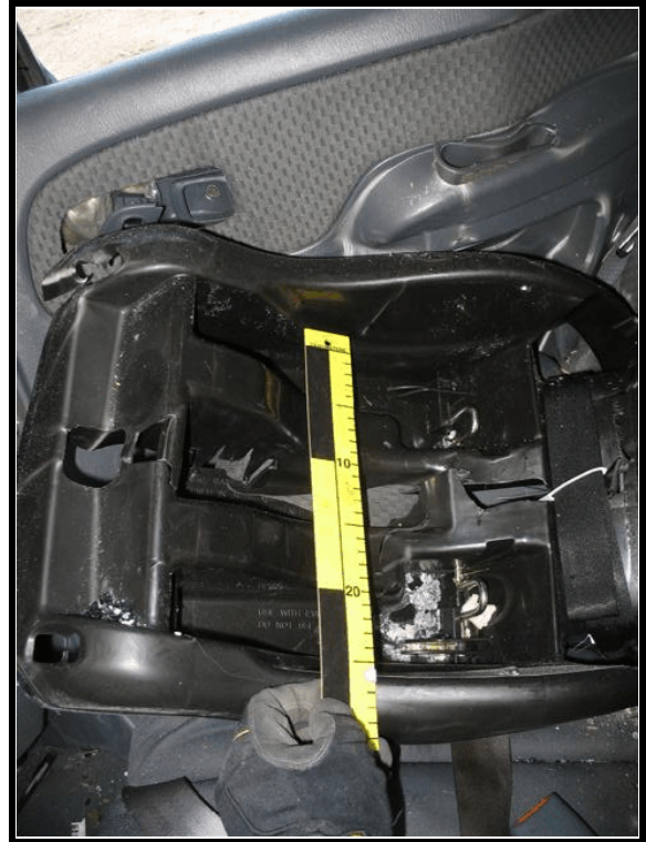
Figure 12. Damaged ISS base

According to Evenflo literature, this seat model had been side impact tested.