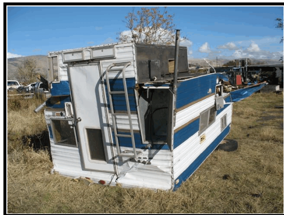
Figure 17. Kit Cabover Camper