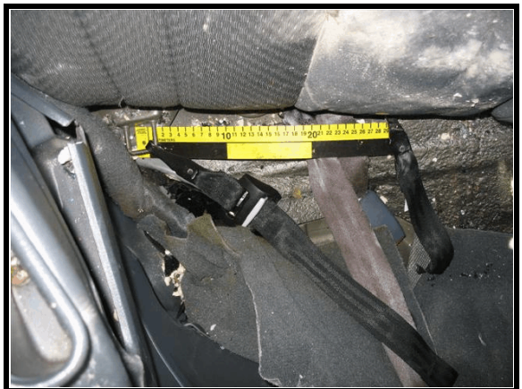
Figure 13. LATCH anchors and straps (looking toward rear of vehicle)