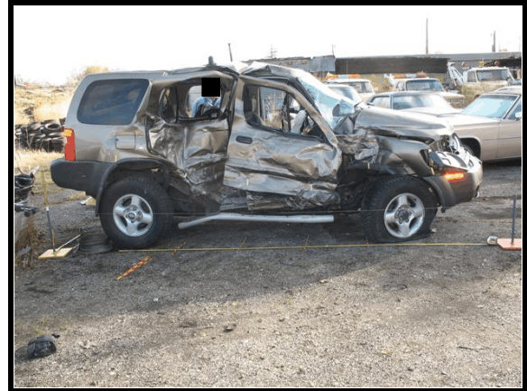
Figure 1. Subject vehicle, 2002 Nissan Xterra

This on-site Child Restraint System (CRS) investigation focused on the occupants and Infant Safety Seat (ISS) in a 2002 Nissan Xterra sport utility vehicle that was involved in a side impact crash ( Figure 1 ). The crash occurred in November 2009 at 1000 hours. The vehicle was being driven by a restrained 21-year-old female. The front right seat of the Nissan was occupied by a restrained 55-year-old female and the second row left seat was occupied by a restrained 28-year-old female. The second row right seat was occupied by a 1-month-old female who was seated in the rear-facing ISS. The ISS was anchored to the vehicle using the Lower Anchors and Tethers for Children (LATCH) hardware. The other vehicle was a 1979 GMC Sierra Grande pickup with a slide-in camper that was being driven by a 75-year-old male.