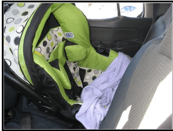
Figure 14. Evenflo Embrace ISS

After the ISS carrier was removed from the vehicle, the seat base and its installation was observed with the base still anchored to the vehicle. The driver had been instructed in the installation procedures by a local law enforcement officer. To all appearances, the installation appeared correct and there was virtually no movement of the seat. It should be noted that the right rear door intruded into this seating area and seat was pinned into place by the door. Efforts were undertaken to remove the seat base by the investigating officer. When this could not be done by loosening the adjuster strap, the LATCH straps were cut and the base was removed from the vehicle. The distance from the anchor attachment to the buckle adjuster measured 32.0 cm (12.6 in).