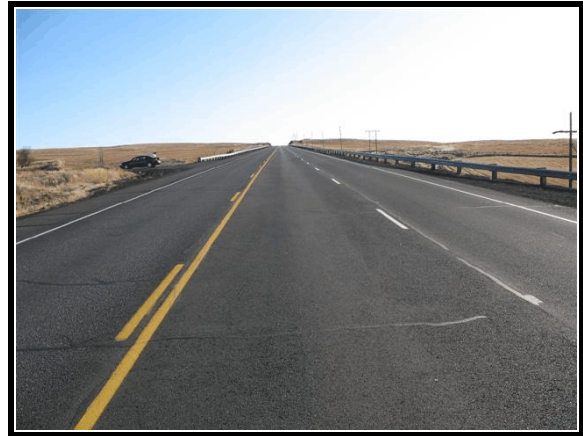
Figure 2. Southbound approach, subject vehicle

The Nissan was traveling southbound in the inboard travel lane at a driver-stated speed of 97 km/h (60 mph). The GMC was traveling northbound.