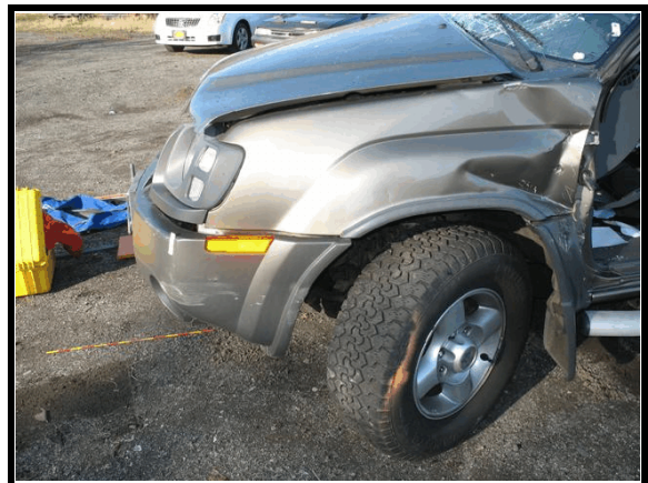
Figure 5. Left front damage

The vehicle sustained minor left side damage due to the impact with the guardrail ( Figure 5 ). The direct damage began at the front left bumper corner and extended rearward 84.0 cm (33.0 in) along the bumper fascia and including light contact to the wheel hub. The maximum crush was located at the left bumper corner and measured 3.0 cm (1.2 in). The CDC for the guardrail impact was 07LFES1. There was also damage to the side panel near the left A-pillar that was probably a result of extrication efforts.