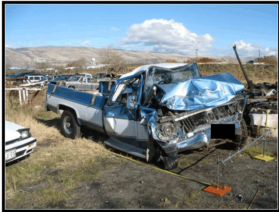
Figure 16. Front right, 1979 GMC pickup

During the impact, the Kit camper was displaced from the bed of the vehicle, rolled two quarter turns, and came to rest on its roof.