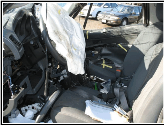
Figure 6. Front row contacts and intrusion