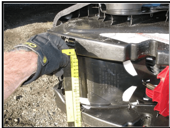
Figure 15. Damage to ISS carrier

Both the ISS carrier and the base were damaged during the crash due to the lateral intrusion of the second row right door ( Figures 14-15 ). References to the damage to the rear-facing seat will be as viewed forward-facing in the vehicle. The seat base was deformed and fractured on the right side (side next to the door). There were several fractures in the center area and a 12.0 x 4.0 cm (4.7 x 1.6 in) section of plastic was fractured and displaced. At either end, there were hazed areas of plastic that was indicative of compression or bending. The carrier was fractured on the left side and the fracture extended to the bottom of the left base insertion area.