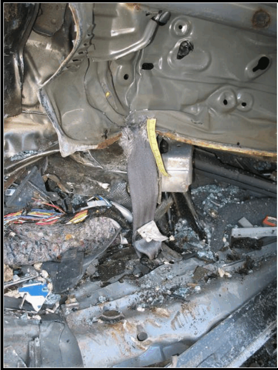
Figure 9. Front right seat belt (at anchor)