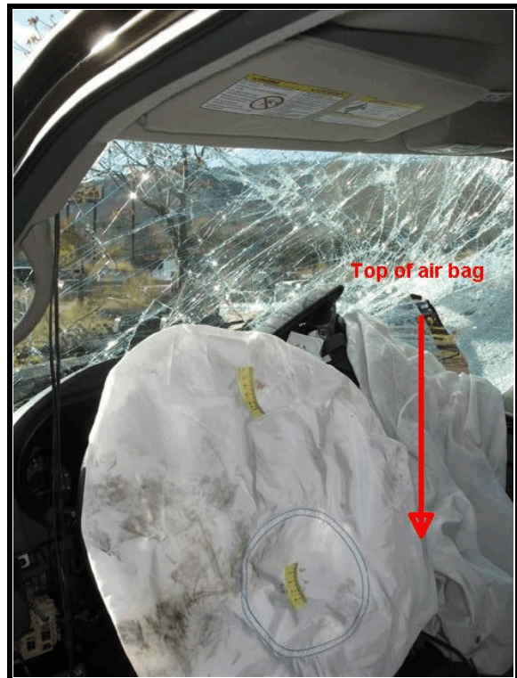
Figure 11. Driver air bag

The driver air bag module was located in the center hub of the steering wheel. The module cover flaps were designed in a tri-fold pattern. The upper flap measured 14.0 x 4.0 cm (5.5 x 1.6 in), width by height. The symmetrical lower flaps measured 8.0 x 6.0 cm (3.1 x 2.4 in), width by height. There was no damage or occupant contact to the flaps. The driver air bag measured 62.0 cm (24.4 in) in diameter in its deflated state. The bag was tethered by a single strap and vented by two ports located on the back side of the bag in the 11/1 o'clock sectors. The right side of the face of the air bag was dirt and grease covered; a small blood drop was located at the bottom of the bag ( Figure 11 ). The front right passenger air bag was located in the right aspect of the instrument panel. The air bag deployed from a top-mount