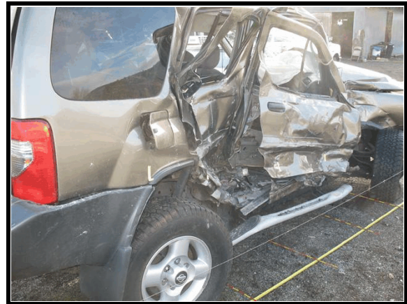
Figure 4. Right side damage, subject vehicle

The Nissan sustained moderate right side damage due to the impact with the front of the GMC ( Figure 4 ). The direct damage began 31.0 cm (12.2 in) forward of the rear axle and extended forward 240.0 cm (94.4 in). The Field L began 13.0 cm (5.1 in) aft of the rear axle and extended forward 314.0 cm (123.6 in). Six crush measurements were documented at the mid-door level: C_1 = 0 cm, C_2 = 32.0 cm (12.6 in), C_3 = 46.0 cm (18.1 in), C_4 = 32.0 cm (12.6 in), C_5 = 40.0 cm (15.7 in), C_6 = 0 cm. The maximum crush was located 85.0 cm (33.4 in) forward of the rear axle and measured 69.0 cm (27.1 in). The height of the maximum crush was 74.0 cm (29.1 in) and the Door Sill Differential (DSD) was 26.0 cm (10.2 in). The Collision Deformation Classification (CDC) for the right side impact was 02RZAW3.