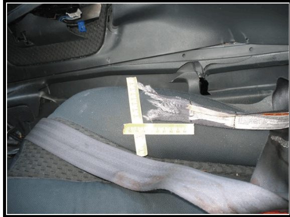
Figure 10. Front right seat belt (in vehicle)