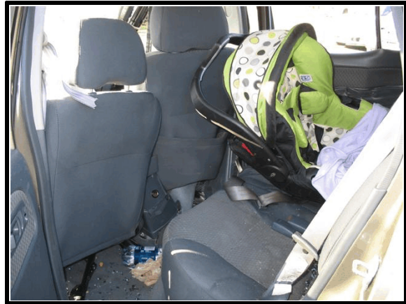
Figure 7. Overview of second row