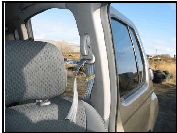
Figure 8. Driver seat belt loading

The Nissan was configured with 3-point manual lap and shoulder belts for the four outboard seat positions and a lap belt for the second row middle seat position. The vehicle was equipped with driver and front passenger safety belt retractor pretensioners that actuated as a result of the crash. The front seats were equipped with seat belt anchorages that were in the full-up position. The driver's safety belt was configured with a sliding latch plate and an Emergency Locking Retractor (ELR); it was being used at the time of the crash. There were abrasions observed at the latch plate and at the anchorage consistent with driver loading ( Figure 8 ). The belt webbing had been cut by emergency personnel at a point 18.0 cm (7.0 in) from the stop button.