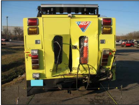
Figure 8: View of the GMC's back plane.

The direct contact damage began 34 cm (13.5 in) left of center and extended 144 cm (56.5 in) to the right corner of the bumper. Within the damaged region, the height of the direct contact on the back plane of the truck measured 191 cm (75 in) above the ground. The residual crush profile along the rear bumper of the truck was as follows: C1 = 0, C2 = 0, C3 = 11 cm (4.3 in), C4 = 27 cm (10.6 in), C5 = 34 cm (13.4 in), C6 = 50 cm (19.7 in). The right wheelbase was reduced 6 cm (2.5 in). The left wheelbase was unchanged. There was contact between the forward right corner of the utility box and the right aspect of the cab. The cab's right door frame overlapped the right B-pillar structure 3 cm (1.0 in). The backlight of the cab was disintegrated. The CDC was 06-BDEW3.