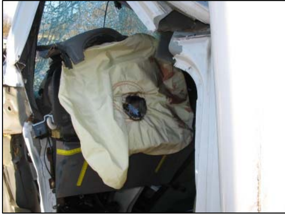
Figure 11: View of the deployed driver air bag.