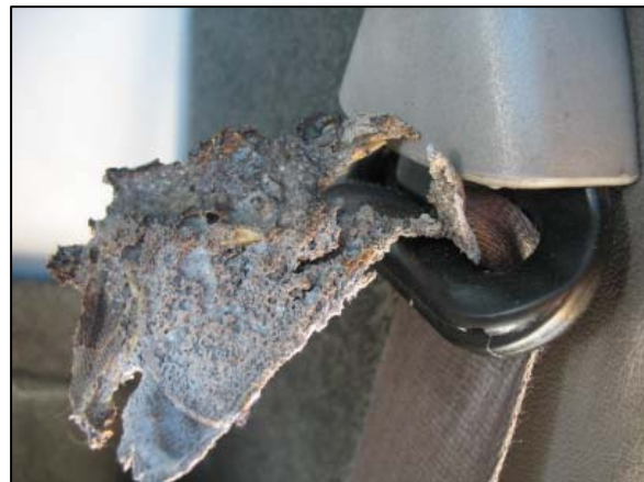
Figure 13: View of the driver's safety belt webbing at the D-ring.

The 1998 Ford E350 was equipped with manual 3-point lap and shoulder safety belts for the two seating positions. The driver's safety belt was configured with continuous loop webbing, a sliding latch plate, a height adjustable D-ring, an Emergency Locking Retractor (ELR), and a buckle-mounted pretensioner. The D-ring was adjusted to the full-down position at the time of the SCI inspection. The buckle pretensioner had actuated during the impact evidenced by buckle stalk compression. The latch plate was still buckled into the receiver and a 124 cm (49 in) length of webbing was threaded through the latch plate. The first responders had cut the webbing in order to remove the driver from the vehicle. The webbing was cut immediately above the sleeve at the outboard anchor and at a position 56 cm (22 in) above the latch plate. This webbing section was creased at the latch plate. At the D-ring, a 10 cm (4 in) section of the webbing was observed to be heat-stressed and brittle. Melted fabric from the air bag was fused to the webbing. Figure 13 is a view of the shoulder belt webbing and melted air bag fabric. This section of the belt contacted the driver air bag and the hot inflator when the driver was slumped forward at final rest. The hot inflator melted the air bag fabric and belt webbing. When the webbing was cut by the first responders, the melted section was captured in the D-ring