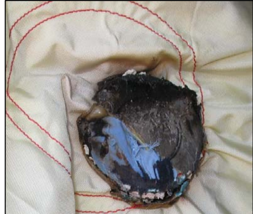
Figure 12: Close-up view of the driver air bag inflator visible through the face of the melted air bag.

The front right air bag was a top-mount design incorporated into the right aspect of the instrument panel. The air bag was concealed by a single cover flap that measured 29 cm (11.5 in) in height and 39 cm (15.5 in) in width. The rectangular shaped air bag membrane measured 91 cm (36 in) in height and 46 cm (18 in) in width. The air bag contained two vent ports on the side panels. The air bag membrane was free of damage and occupant contacts.