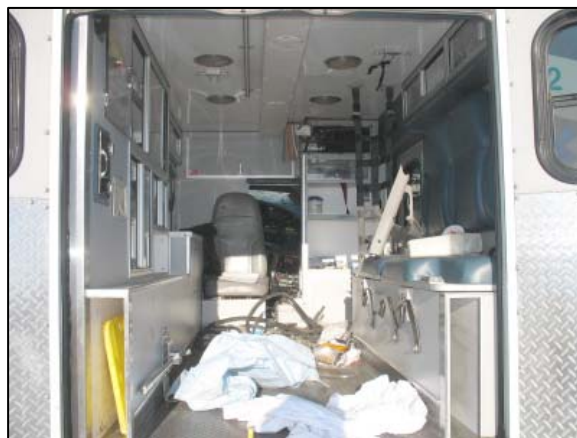
Figure 14: Rear view into the patient compartment.

Figure 14 is a view into the patient compartment through the rear doors. There was no interior damage to the left, rear or right side walls and cabinetry. The interior was constructed of plywood overlaid with composite panels and aluminum trim. The cabinets had fore/aft sliding plexiglass doors with friction closures. The box-mounted rear-facing jump seat was located at the forward wall, behind the driver's position. The cushion of the seat appeared to have been loaded by the patient and/or loose objects during the crash. The floor-mounted antler bracket and rail clamp that secured the cot in its transport position were not damaged.