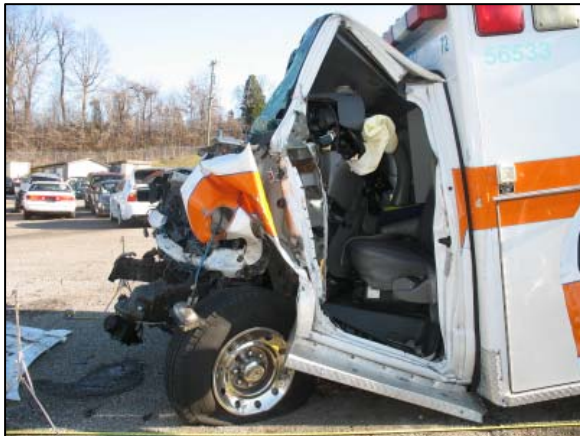
Figure 6: Left view depicting the extent of crush.