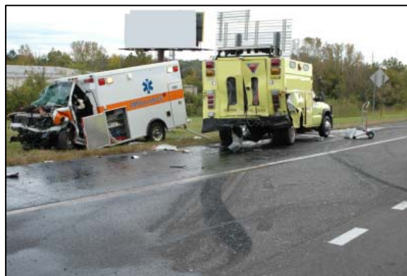
Figure 1: On-scene image of the vehicles at final rest.

This on-site investigation focused on the front-to-rear crash of a 1998 Ford E350 Type III ambulance and a stopped 2006 GMC K3500 work truck. The ambulance was conducting a non-emergency transport of a 78-year-old female patient from a dialysis treatment back to her assisted-living-center home at the time of the crash. The restrained 36-year-old male driver and the patient were fatally injured. The unrestrained 51-year-old male paramedic seated on the right bench seat within the patient compartment sustained severe injuries. Figure 1 is an on-scene image of the crash site taken by the investigating police department.