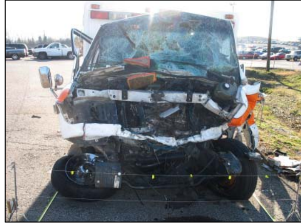
Figure 5: Front view of the ambulance