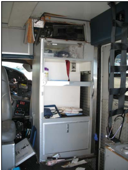
Figure 17: Forward cabinet fractured by occupant contact.

A 170 x 71 cm (67 x 28 in) three-shelf cabinet was located at the forward right aspect of the patient compartment. The upper inboard corner of this cabinet was fractured by contact from the displaced patient and paramedic ( Figure 17 ). The entire cabinet was also displaced forward 5 cm (2 in), measured at its inboard corner. The aluminum trim surrounding the shelves and corners was abraded. The paramedic's hat was found within the fractured top shelf area. A 22 x 25 in area of body fluid spatter was located on the forward wall, left of the fractured cabinet, Figure 18 .