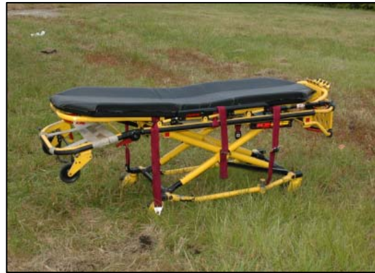
Figure 19: Police supplied image of the Stryker cot.

The cot used to transport the patient in this crash was a Stryker MX-PRO. It was not damaged during the crash event. Figure 19 is a police image of the cot. The cot was not damaged during the crash. It was moved out of the patient compartment by the first responders prior to the arrival of the police investigator. At the conclusion of the on-scene police investigation, the cot was removed from the crash site by the ambulance company. The cot was placed back in service the day following the crash and was not inspected for this SCI investigation.