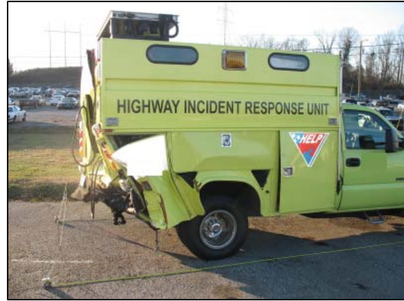
Figure 9: Right view depicting the extent of crush.