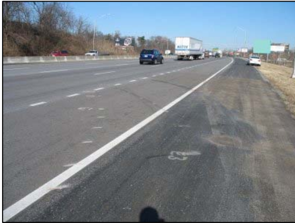
Figure 3: View of the post-crash tire marks defining the trajectory of the GMC.

170 degrees CCW across the shoulder. The vehicle came to rest in the outboard northbound lane, 17 m (56 ft) north of the point of impact. Its post-impact movement was evidenced by three arcing tire marks, Figure 3 . The driver then moved the GMC to its post-crash location on the right shoulder of the roadway. The ambulance continued along its northeast trajectory and came to rest on the east roadside 18 m (59 ft) from the impact. Its post-crash trajectory was evidenced by two parallel gouge marks in the roadside terrain, Figure 4 .