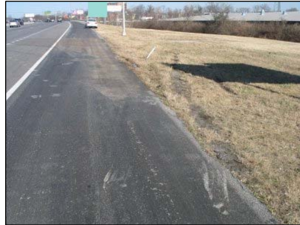
Figure 4: View of the point of impact and post-crash trajectory of the ambulance.

The Damage Algorithm of the WinSMASH program was used to determine the severity of the crash (delta-V). This analysis was considered to be borderline and the results underestimated the crash severity. The severity was underestimated due to the use of the default stiffness values of a GMC pickup truck as a substitute for the unknown stiffness of the involved GMC work truck. The total delta-V of the ambulance was 45.0 km/h (28.0 mph). The longitudinal and lateral components were -44.3 km/h (-27.5 mph) and -7.8 km/h (-4.8 mph), respectively. The total delta-V of the GMC was 33.0 km/h (20.5 mph) with longitudinal and lateral components of 32.5 km/h (20.2 mph) and 5.7 km/h (3.5 mph), respectively. The Barrier Equivalent Velocity of the ambulance 55.5 km/h (34.5 mph). An in-line momentum calculation of the crash determined the impact speed of the ambulance was 100 km/h (62 mph) with a delta-V of 58 km/h (36 mph).