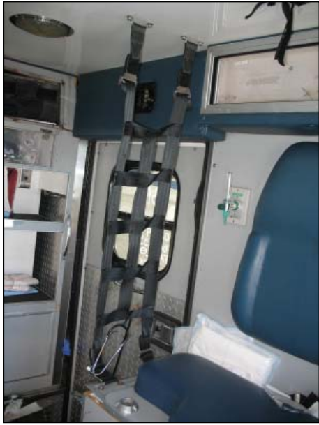
Figure 15: View of the net restraint.