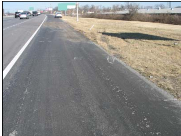
Figure 2: Northward view of the point of impact.

This two-vehicle crash occurred during the daylight hours of October 2009. At the time of the crash, the weather was not a factor. The crash occurred on a 5-lane interstate highway within the city limits. The road was straight and level in the area of the crash. Approximately 0.8 km (0.5 mile) south of the crash site, the two outboard lanes of the interstate had merged with the three inboard lanes forming the 5-lane interstate. The ambulance was northbound in the outboard lane. The width of the asphalt shoulder outboard the right-most lane measured 3.6 m (11.8 ft). The east roadside consisted of grass terrain. The speed limit in the area of the crash was 89 km/h (55 mph). Figure 2 is a northward view of the crash site at the point of impact.