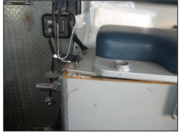
Figure 16: View of the fractured base cabinet as a result of the net restraint loading.

A 170 x 71 cm (67 x 28 in) three-shelf cabinet was located at the forward right aspect of the patient compartment. The upper inboard corner of this cabinet was fractured by contact from the displaced patient and paramedic ( Figure 17 ). The entire cabinet was also displaced forward 5 cm (2 in), measured at its inboard corner. The aluminum trim surrounding the shelves and corners was abraded. The paramedic's hat was found within the fractured top shelf area. A 22 x 25 in area of body fluid spatter was located on the forward wall, left of the fractured cabinet, Figure 18 .