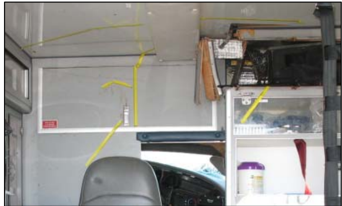
Figure 18: View of the fractured cabinet and fluid evidence.