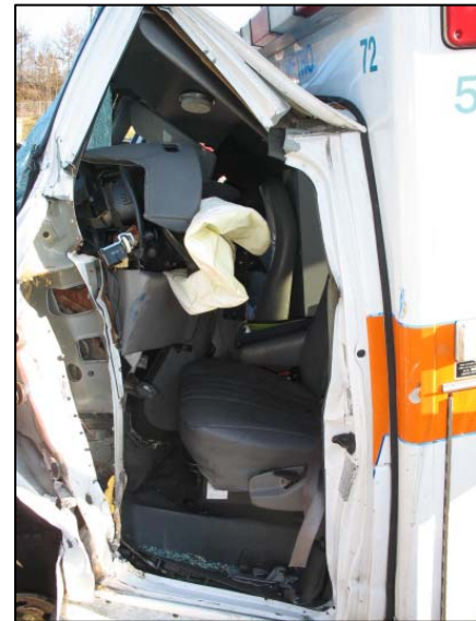
Figure 10: Left lateral view of the ambulance cab.

The interior of ambulance cab sustained severe intrusion as a result of the frontal crash. Figure 10 is a left lateral view of the ambulance cab. The box-mounted driver seat was adjusted to the full-rear track position and was jammed in place. The seat track travel of an exemplar vehicle measured 19 cm (7.5 in). The seat back angle measured 10 degrees aft of vertical. The horizontal distance from the seat back to the driver air bag module in the center of the steering wheel measured 46 cm (18.1 in). The adjustment of the two-spoke, tilt steering wheel was unknown. In its undamaged condition the driver air module is located approximately 1 cm (0.5 in) forward of the plane of the steering wheel rim. At inspection, the driver air bag module/inflator hub protruded 8 cm (3 in) aft of the plane of the steering wheel. As the driver loaded the deployed air bag and steering wheel rim during the crash, the steering column was displaced rearward (through the plane of the rim) due to the extent of the crush. There was no separation of the steering column's shear capsules from the intruded instrument panel.