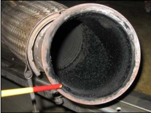
Figure 12. Oil and carbon deposits on the turbocharger exhaust pipe.