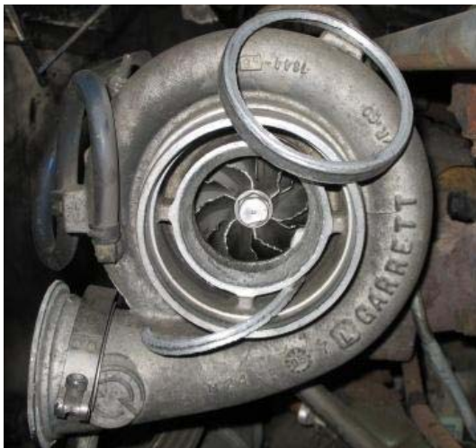
Figure 8. Damaged intake impeller and separated air deflector.

Intake air to the turbocharger was provided from the fresh air intake and through a radiator-mounted heated air exchanger utilizing separate ducting. The intake impeller side of the turbocharger was fitted with an aluminum deflector designed to channel the airflow into the intake impeller. The impeller blades engaged and damaged this deflector, separating it from the pressed fit within the intake opening. Fragments of this deflector were found in the intake port of the turbocharger ( Figure 8 ). Figure 9 is a view of an exemplar turbocharger with damaged impeller blades and the deflector in place.