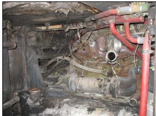
Figure 15. Fire damage to the forward left side engine compartment.