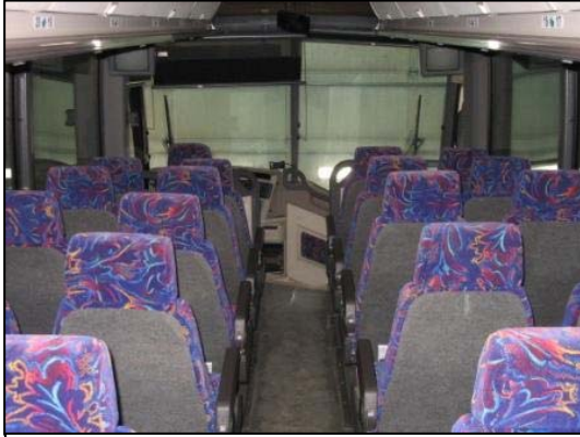
Figure 4. Forward view of the interior of the motorcoach.