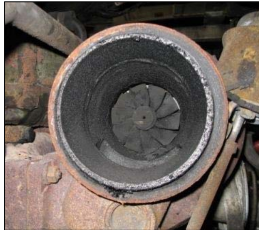
Figure 11. Carbon and oil deposits on the exhaust impeller and port of the turbocharger