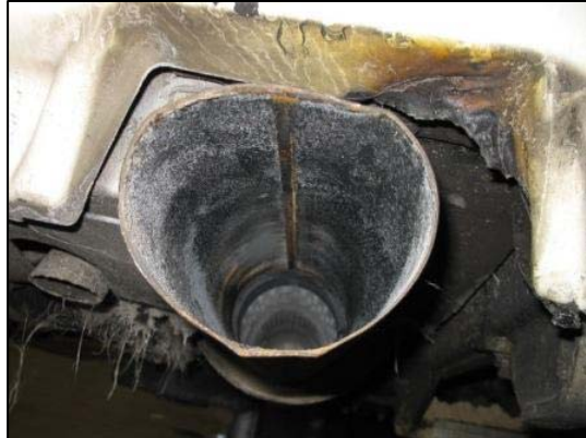
Figure 13. Inside view of the condition of the tailpipe.