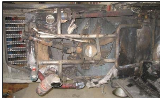
Figure 7. Fire damage to the cooling system.