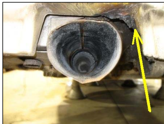
Figure 5. Fire damage to the bumper fascia.

Subtle smoke staining was present on the top of the louvered cooling compartment door at the left rear corner of the motorcoach. The fiberglass louvers were intact and the painted surface was not damaged. There was no other exterior damage to the motorcoach. The tires were not involved.