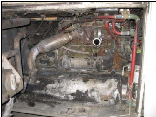
Figure 6. Fire/heat related damage to the exhaust system heat shield.

There was no fire-related damage to the engine, transmission, differential, or tires. It should be noted that the engine oil was approximately 3.7 liters (4 quarts) low at the time of the SCI inspection.