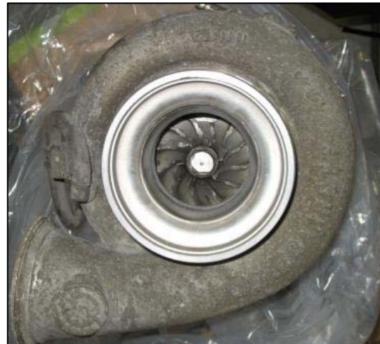
Figure 9. Exemplar intake with air deflector in place.

The post-fire inspection of the turbocharger determined that the impeller shaft was slightly deformed. The impeller shaft could easily be rotated by hand with a noticeable wobble to the intake impeller. The waste gate linkage remained operational.