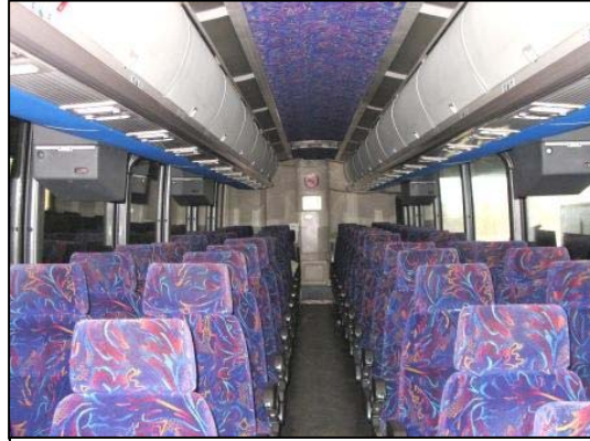
Figure 3. Rearward view of the motorcoach interior.