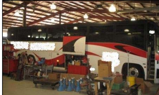
Figure 1. Right side view of the 2001 MCI E4500 motorcoach.

This on-site investigation focused on the origin and severity of a fire that involved a 2001 Motor Coach Industries (MCI) Model E4500 motorcoach ( Figure 1 ). The motorcoach was occupied by the 58-year-old male driver and 38 adult passengers. The motorcoach was traveling southbound on an interstate roadway when a fire initiated in the back of the vehicle. The driver was alerted to the fire by a passing truck driver. The motorcoach driver brought the vehicle to a