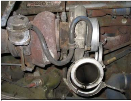
Figure 10. Oil present in the warm air intake port of the turbocharger.

The exhaust side impeller of the turbocharger was intact and undamaged. The blades were covered with a layer of carbon. The exhaust housing port yielded heavy, oil soaked, carbon deposits ( Figure 11 ).