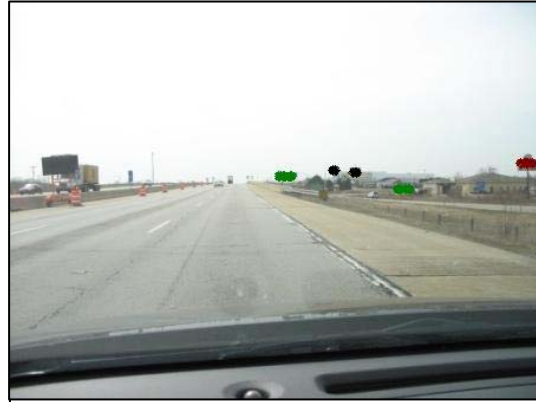
Figure 2. Overall view of the incident site.

separated by a concrete median barrier. The southbound travel lanes were straight with a slight positive grade of less than 2 percent. A wide concrete surfaced shoulder supported the outboard travel lane. A construction work zone was present at the incident site and consisted of orange construction barrels that channeled traffic flow from the left lane to the inboard lane. The work zone was not active at the time of the incident. The work zone reduced the posted speed limit from 105 km/h (65 mph) to 89 km/h (55 mph). Figure 2 is an overall view of the incident site. A schematic of the incident is included as Figure 16 .