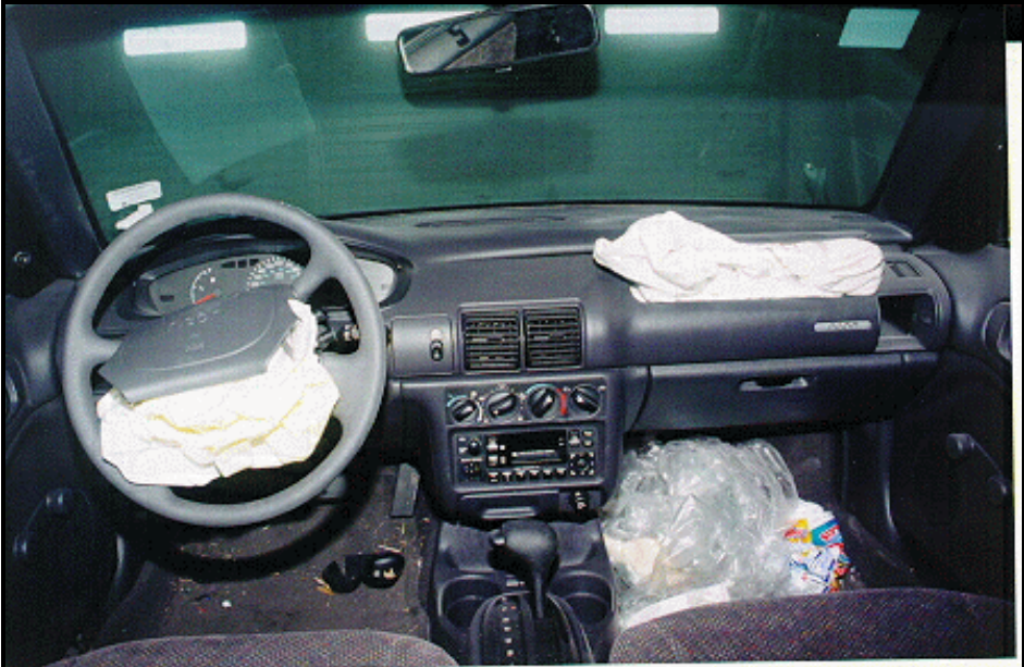
Figure 7: Case vehicle's instrument panel, center console, and deployed air bags (case photo #22)