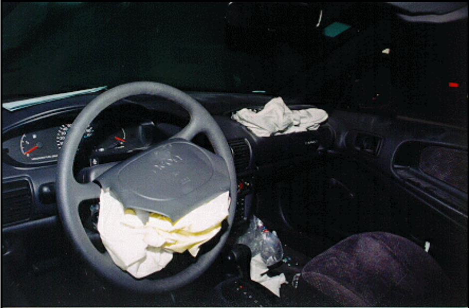
Figure 5: Case vehicle's steering wheel and driver's air bag module (case photo #23)