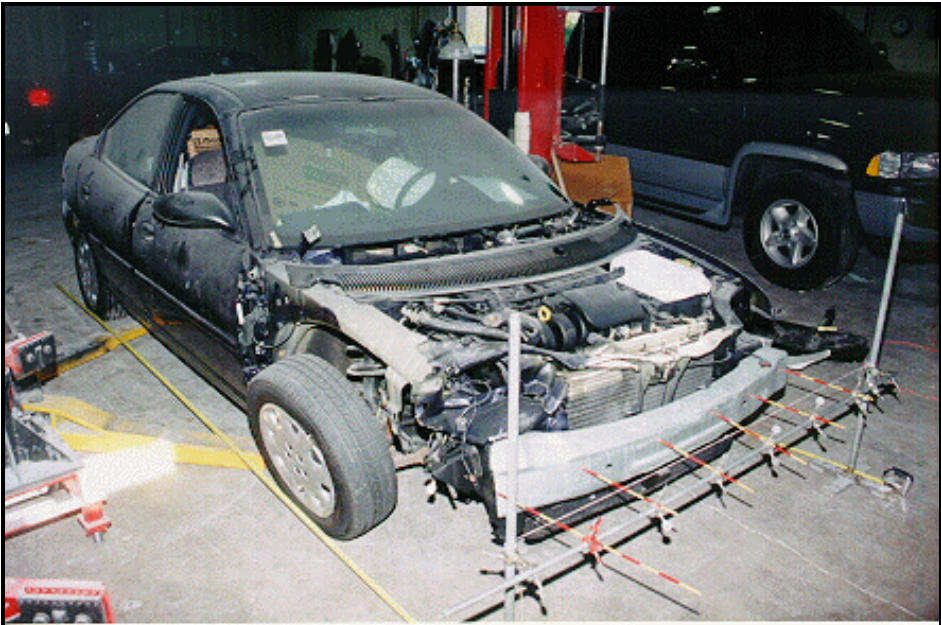
Figure 2: Case vehicle’s front and right side with bumper cover, grille, hood, and right fender removed (case photo #16)