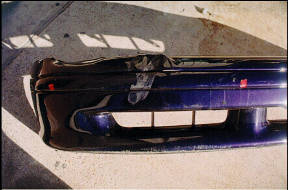
Figure 3: Closeup of direct contact on front right corner of case vehicle's bumper cover (case photo #19)