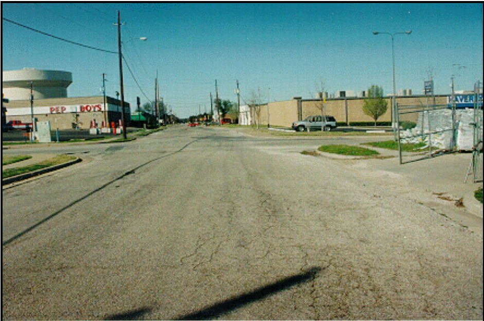
Figure 1: Case vehicle’s northbound approach toward impact within the intersection (case photo #1)