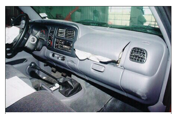
Figure 13: Case vehicle's deployed driver and front right passenger air bags and instrument panel areas; Note: no contact evidence on front right air bag module's cover flap or center or right instrument panel areas (case photo #27)