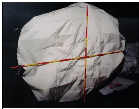
Figure 9: Case vehicle's deployed driver air bag showing no contact evidence on air bag's front surface (case photo #22)