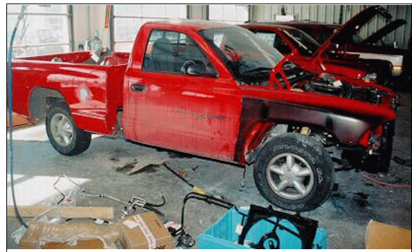
Figure 7: Case vehicle's right side showing repairs to right fender and right side of truck bed; Note: rightward shift to truck bed (case photo #12)

The case vehicle was equipped with a Supplemental Restraint System (SRS) that contained frontal air bags at the driver and front right passenger positions. Both air bags deployed as a result of the frontal impact with the unknown object. The case vehicle's driver air bag was located in the steering wheel hub. The module consisted of asymmetrical cover configuration cover flaps made of thick vinyl with overall dimensions of 15 centimeters (5.9 inches) at the horizontal seam and 10 centimeters (3.9 inches) vertically for the upper flap and 2 centimeters (0.8 inches) vertically for the lower flap. An inspection of the air bag module's cover flaps and air bag revealed that the cover flaps opened at the designated tear points, and there was no evidence of damage during the deployment to the air bag or the cover flaps. The driver's air bag was designed with two tethers, attached to the center of the air bag. The driver's air bag had no vent ports. The deployed driver's air bag was round with a diameter of 65 centimeters (25.6 inches). There was no contact evidence readily apparent on any of the surfaces (i.e., top, front, bottom, etc.) of the driver's air bag (Figures 8 and 9 and Figure 10 below, respectively).