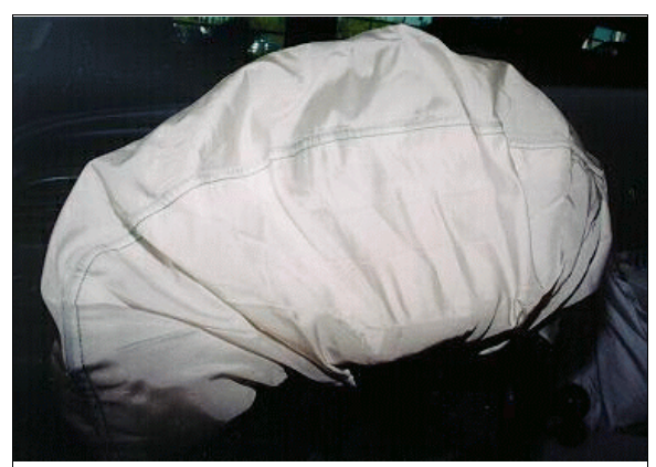
Figure 10: Case vehicle's deployed driver air bag showing no contact evidence on bottom/back surface of air bag (case photo #25)