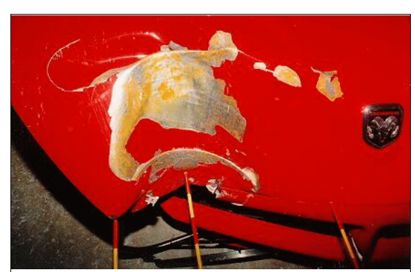
Figure 5: Close-up of narrow object impact to right side of case vehicle's hood (case photo #15)

at all, given the damage pattern, that the case vehicle impacted a "W-beam" guardrail. Neither is it likely that the case vehicle struck one of the round, metal, guardrail support posts (even with a guardrail section missing) because they are not tall enough to reach the case vehicle's front hood seam. Therefore, in this contractor's opinion, the third scenario (i.e., a right roadside departure and impact with a "pole-like" object) seems to conform more closely with the known facts of the case and, thus, the location of this crash should be considered unknown.