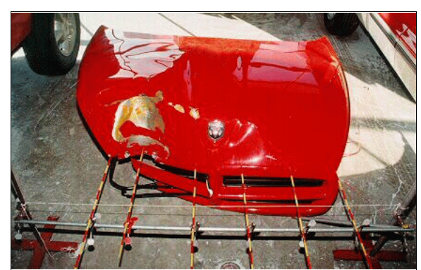
Figure 4: Case vehicle's damaged hood laid on repair shop floor; Note: rounded narrow object imprint to front right (case photo #14)