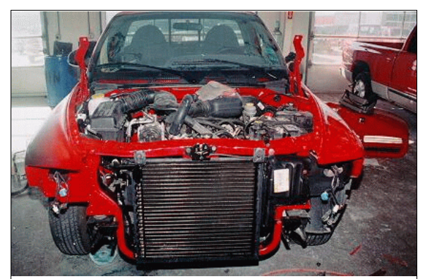
Figure 3: Case vehicle's partially repaired frontal damage; Note: new radiator <u>and</u> damaged hood along left side of vehicle (case photo #07)

posts, approximately 10 centimeters (4 inches) in diameter. Additionally, two sections of the guardrail had been replaced, but the timing of that replacement is unknown ( Figure 2 above). A third scenario was offered to this contractor's consultant by the body shop's personnel. The body shop personnel believe (based on unknown information) that the case vehicle was involved in a right roadside departure and impacted a "pole-like" object west of the final rest area, upstream from the area depicted on the Police Crash Report. The driver left the actual crash scene and continued driving eastward when the case vehicle's engine stopped running, some unknown distance east of the actual impact area. According to the Police Crash Report, the investigating officer found no evidence of a crash at the location where the vehicle was found.