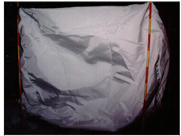
Figure 11: Case vehicle's deployed front right passenger air bag showing no contact evidence on air bag's front surface (case photo #30)

The front right passenger's air bag was located in the middle of the instrument panel. There was a single, essentially rectangular, modular cover flap. The cover flap was made of a thick vinyl over a thick cardboard-type frame. The flap's dimensions were 33 centimeters (13.0 inches) at the lower horizontal seam and 22 centimeters (8.7 inches) along both vertical seams. The profile of the case vehicle's instrument panel appears to be flush with the leading edge of the cover flap (i.e., based on the available photographs). An inspection of the front right air bag module's cover flap and air bag revealed that the cover flap opened at the designated tear points, and there was no evidence of damage during the deployment to the air bag or the cover flap. The front right passenger's air bag was designed without any tethers or vent ports. The deployed front right air bag was rectangular with a height of approximately 52 centimeters (20.5 inches) and a width of approximately 58 centimeters (22.8 inches). There was no contact evidence readily apparent on any of the surfaces (i.e., front, top, bottom, right, or left) of the front right air bag ( Figure 11 ).