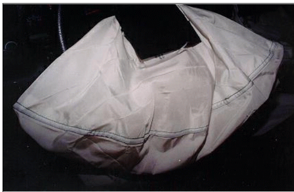
Figure 8: Case vehicle's deployed driver air bag showing no contact evidence on top/back surface of air bag or to air bag module's top cover flap (case photo #21)