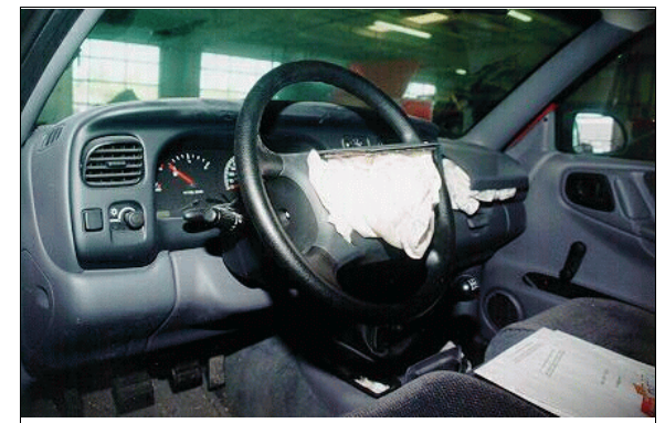
Figure 12: Case vehicle's front seating area showing deployed driver and front right passenger air bags and no contact evidence on steering wheel, left instrument panel, or driver's knee bolster (case photo #18)

Inspection of the case vehicle's interior revealed that there was no evidence of occupant contact on the interior surfaces of the case vehicle (Figures 12 and 13).