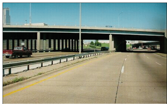
Figure 1: Case vehicle's northeastward path of travel off road toward Police Crash Report's impact site with guardrail on northwest roadside (case photo #03)

Three crash scenarios have been discovered (i.e., no interview was obtained with the driver). The Police Crash Report indicated the case vehicle's driver took unknown evasive maneuvers in an attempt to avoid striking a noncontact vehicle which cut in front of him. As a result, the case vehicle collided with the guardrail on the service road's northwest roadside ( Figure 2 ). The case vehicle's owner related a second scenario provided by the driver. The driver had picked up a hitchhiker (note: the Police Crash Report indicated only one occupant in the case vehicle)