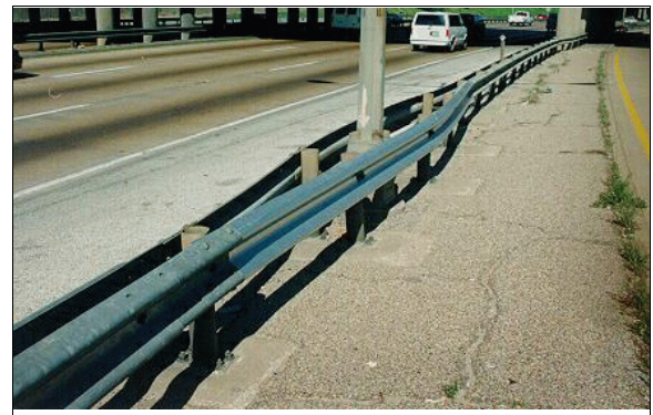
Figure 2: Close-up looking northeastward of Police Crash Report's impact site (case photo #05)

and, for some unknown reason, the hitchhiker grabbed the steering wheel and turned it left, causing the case vehicle to angle into the guardrail on the service road's northwest roadside. Both of the above crash scenarios, however, do not fit the case vehicle's damage pattern. Damage indicates that the case vehicle impacted a round, pole-like object, not a "W-beam" guardrail ( Figures 3 and 4 below). The guardrail at the alleged scene was attached to round, metal support