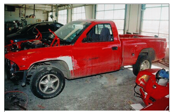
Figure 6: Case vehicle's left side showing repairs to left fender and edge of left front door; Note: induced damage to truck bed (case photo #09)

radiator were directly damaged and crushed rearward (Figure 3 above). It is unknown if the case vehicle's left and right front tires were physically restricted or deflated from the crash. Both the right and left headlight and turn signal assemblies sustained induced damage as well as both the right and left fenders. Furthermore, the leading edge of the driver's door also sustained induced damage (Figure 6), and there was a repaired spot on the right side of the bed of the pickup (Figure 7 below). In addition, the front of the bed of the pickup was tilted upward and the entire bed was displaced towards the right (Figure 6 and Figure 7 below).