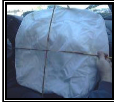
Figure 6. 1998 Chevrolet Cavalier LS redesigned passenger air bag.