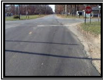
Figure 1. Westbound approach for the 1998 Chevrolet Cavalier LS.