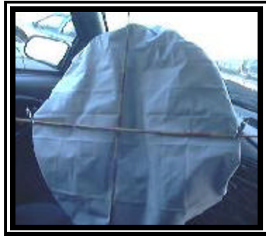
Figure 5. 1998 Chevrolet Cavalier LS redesigned driver air bag.

researcher measured the passenger air bag at 50.0 cm (19.7 in) square in its deflated state ( Figure 6 ). The bag was tethered by two internal straps with no vent ports present. No cutoff switch was found for the front right air bag.