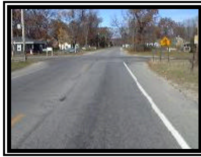
Figure 2. Northbound approach for the 1997 Ford LN8000 tractor truck.