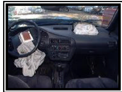
Figure 4. Interior view.

Interior damage to the Chevrolet was minimal and attributed to occupant contact ( Figure 4 ). Scuff marks were documented on the left knee bolster (rigid plastic type). No intrusions were found in the vehicle.