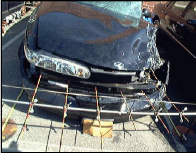
Figure 4. Exterior, Vehicle 2 (1998 Oldsmobile Intrigue)