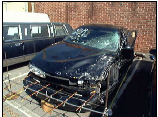
Figure 2. Exterior, Vehicle 2 (Oldsmobile Intrigue)