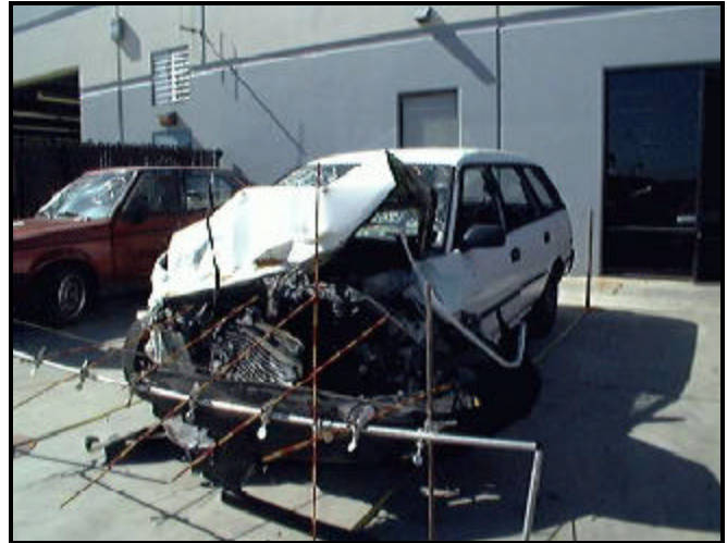
Figure 1. Exterior, Vehicle 1 (Toyota Corolla)

Vehicle 2, a 1998 Oldsmobile Intrigue 4-door sedan (case vehicle) driven by a 33 year old male (190 cm/75 in, 98 kg/215 lbs), was traveling east in the right eastbound travel lane at a driver estimated speed of 56-64 kmph (35-40 mph). The driver was restrained by the available manual lap/shoulder restraint. The front-right seat was occupied by a 31 year old female (163 cm/64 in, 54 kg/120 lbs) who was restrained by the available manual lap/shoulder restraint. The back-center seat was occupied by a 3 year old female (91 cm/36 in, 15 kg/33 lbs) who was restrained in a forward facing "Kolcraft" child safety seat which was anchored by the available manual lap restraint.