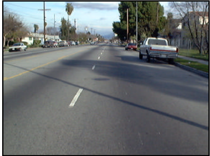
Figure 3. Crash scene. Vehicle 2 approach path.

The driver of Vehicle 1 reported that he “changed lanes pretty fast” and “lost control” of the vehicle. Vehicle 1 crossed from the right westbound travel lane completely across the roadway and entered the path of Vehicle 2 in the right eastbound travel lane. The front plane of Vehicle 2 (12FLEE9) struck the front plane of Vehicle 1 (02FDEW3) in the right eastbound travel lane (event 1). Vehicle 2 then impacted the south curb (event 2) with its right-front wheel (02RFWN3) before coming to rest back in the original lane facing east. Vehicle 1 rotated counter-clockwise approximately 90 degrees after impact and came to rest straddling the two eastbound lanes facing southeast.