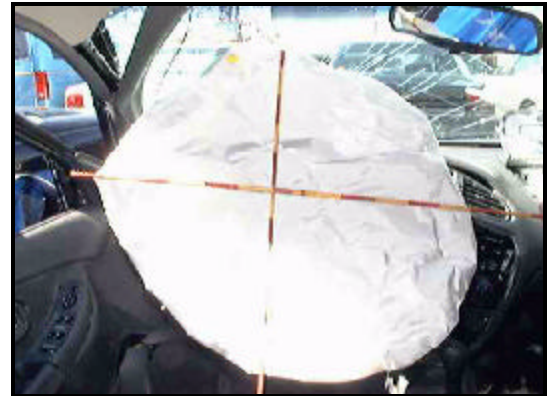
Figure 6. Driver's frontal air bag.

The front left air bag was housed in the steering wheel hub and was concealed by symmetrical I-configuration cover flaps which were not damaged. The circular air bag was equipped with two tether straps and two vent ports. Contact evidence consisting of a small scuff was found on the front of the bag. The bag was not damaged in the crash.