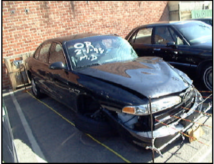
Figure 5. Exterior, Vehicle 2 (1998 Oldsmobile Intrigue)