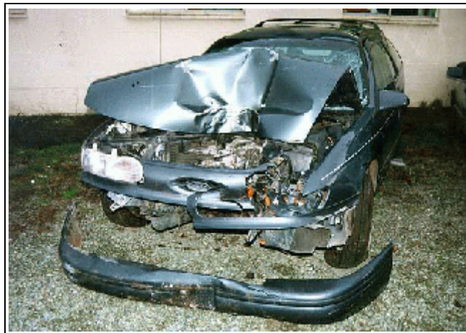
Figure 4. Frontal damage to vehicle.

Vehicle 1 sustained severe damage to the entire front end (see Figure 4). A CDC of 12FYEN2 with a 0 degree PDOF was assigned to the damage. Maximum crush was measured at C 3 and equaled 43.5 cm (17.1 in). The barrier portion of the WinSmash 2 algorithm computed a total Delta-V of 29.1 km/h (18.1 mph), a longitudinal Delta-V of -29.1 km/h (-18.1 mph), and a lateral Delta V of 0. The results fit the collision model and appear reasonable. Vehicle 1 was towed from the scene due to damage.