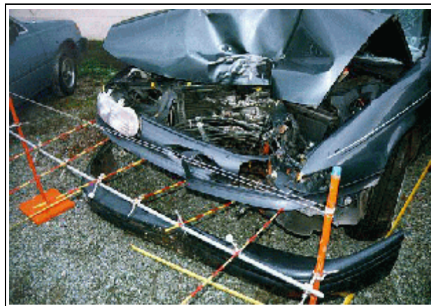
Figure 6. Exterior damage.