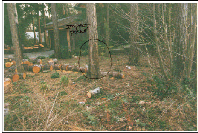
Figure 3. Police photo of tree.

noted that no skid marks were present on the roadway, but there was 15.2 m (50 ft) of tire impression left on the hard packed dirt shoulder. On impact with the tree, the driver's and front right passenger's air bags deployed. Vehicle 1 came to final rest heading south-west in contact with the tree. The driver was conscious at the scene, and when he was interviewed by the investigating police officer, the driver stated that he did not know why he left the roadway.