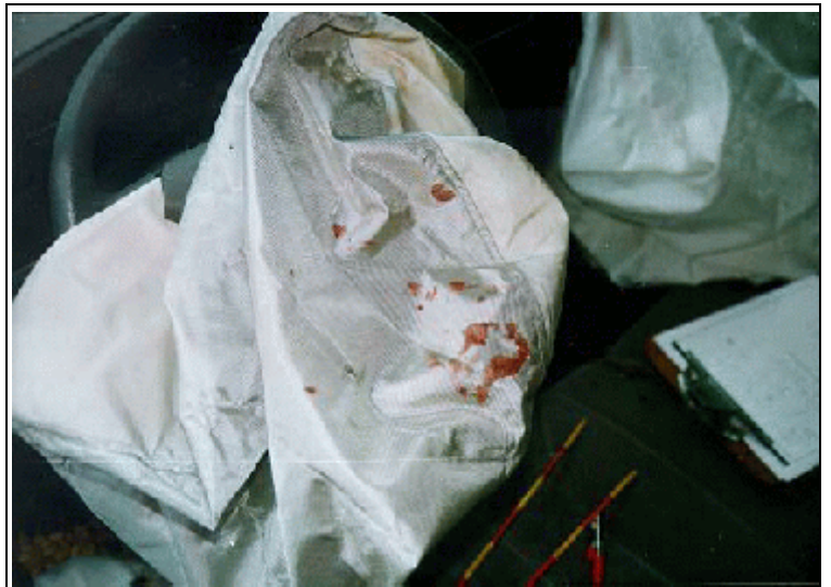
Figure 9. Blood on driver's air bag from lacerations to driver.