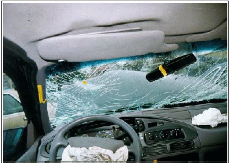
Figure 8. Spider web to windshield from driver's head, and cracked rear view mirror from his right hand.