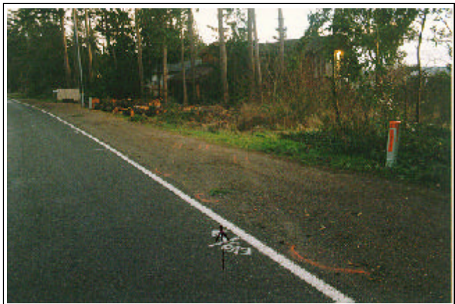
Figure 2. Police photograph of scene towards impact.