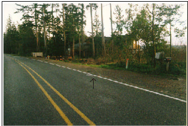
Figure 1. Police photograph of scene.

Vehicle 1, a 1994 Ford Taurus GL 4-door station wagon driven by an 86-year-old male (178 cm / 70 in, 73 kg / 160 lb 1 ), was traveling southbound at a police reported speed of 64-81 km/h (40-50 mph). For an unknown reason, the driver of Vehicle 1 failed to negotiate the left curve and drove off the right roadway edge. Vehicle 1 traveled approximately 15.2 m (50 ft) off the road and into a vacant lot before colliding head on into a 34 cm (13.4 in) diameter fir tree (see Figures 1-3). The police