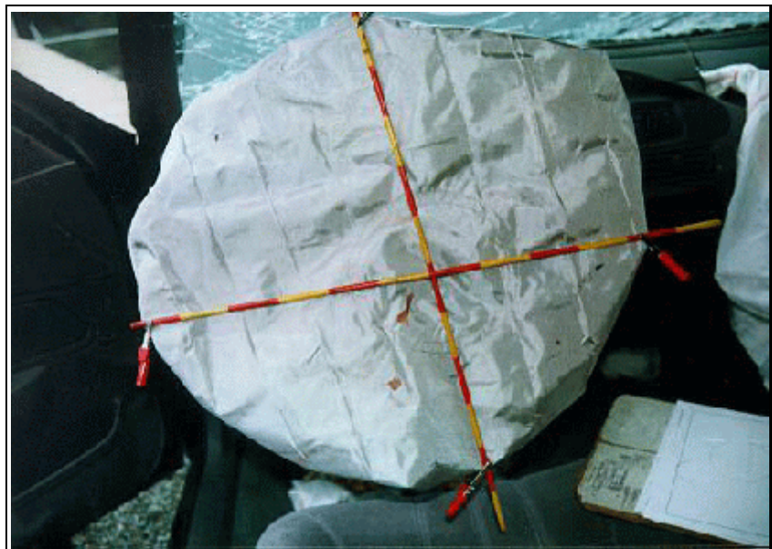
Figure 7. Driver's air bag.

The passenger side air bag is rectangular in shape and measures 63 cm (24.8 in) by 88 cm (34.6 in); it was not tethered and had two vent holes at the rear and left outboard part of the air bag. The passenger's air bag was not damaged. The dual module covers were symmetrical and rectangular in shape and were not damaged.