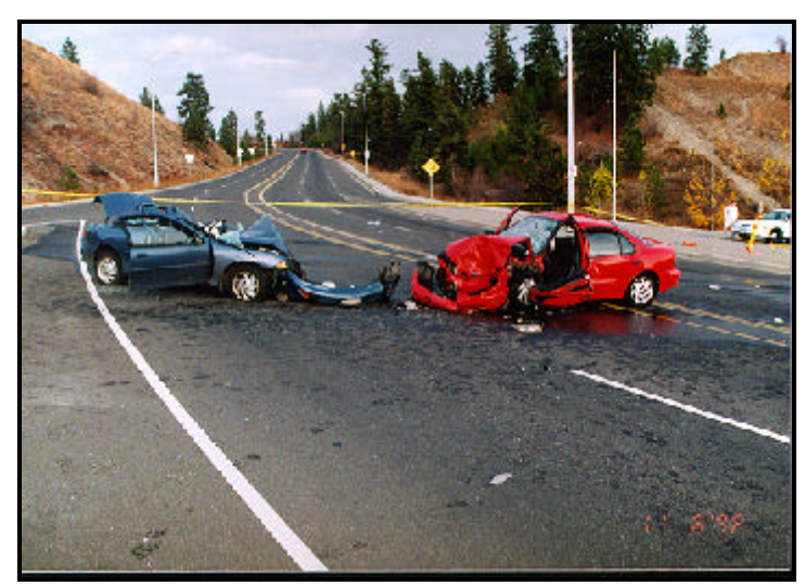
Figure 1. Final rest, facing north.

Vehicle 1, a 1998 Chevrolet Cavalier 4-door (red) driven by a restrained 21-year-old male, was traveling northbound in the second lane of a curved, four-lane, undivided roadway. Vehicle 2, a 1998 Chevrolet Cavalier 2-door driven by a restrained 24-year-old female, was traveling southbound at approximately 61 km/h (38 mph)<sup>1</sup> on the same roadway in