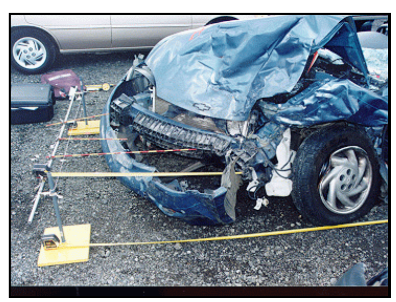
Figure 8. Exterior, Vehicle 2

The rectangular front right air bag was mounted in the top of the instrument panel and measured 53 cm wide by 65 cm high. There were no vents or internal tether