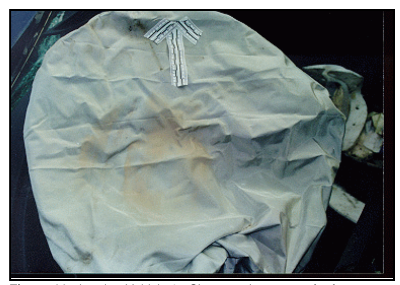
Figure 11 . Interior, Vehicle 2. Shows make-up transfer from driver.

forehead contusion. This occupant sustained an ulna/radius fracture to her left arm. The source of this injury is not known. A probable source would seem to be the instrument panel, however.