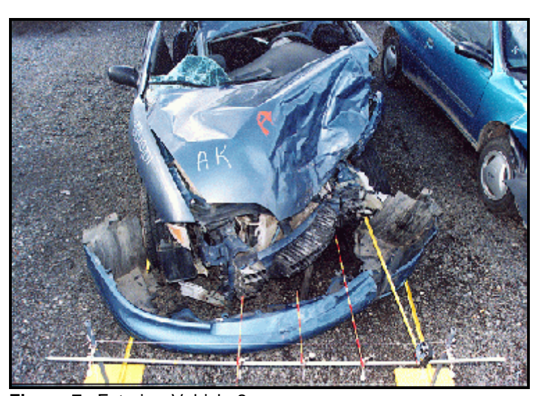
Figure 7. Exterior, Vehicle 2