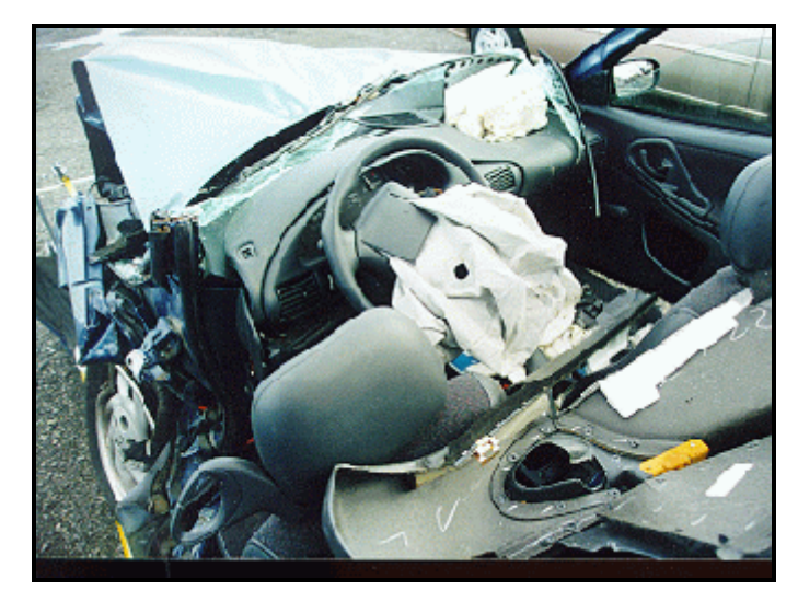
Figure 10. Interior, Vehicle 2

The front right occupant of Vehicle 2 was seated in a normal, upright position. The bucket seat with folding back was adjusted to a mid-track position. This occupant was wearing the available lap and shoulder belt. At impact, the driver reacted to the 355E direction of force by moving forward and slightly to the left. The seat belt restricted the forward motion, and caused the bilateral hip contusions and the chest contusion. As she engaged the left side of the face of the deployed air bag with her face she sustained a minor