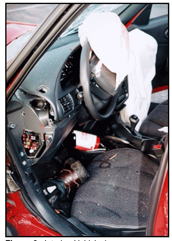
Figure 9. Interior, Vehicle 1

The driver was wearing the available lap and shoulder belt. As stated earlier, there was no indication of braking, but some braking seems likely. At impact, the driver reacted to the 350E direction of force by moving forward and slight to the left. The seat belt restricted the forward motion as she engaged the deployed air bag with her face—deposited a make up transfer on the face of the air bag and caused the concussive injury. The driver slid forward and contacted both sides of the knee bolster with both knees. The encroaching lower instrument panel pinned the driver in the vehicle. As the air bag deployed, it likely pushed the driver's left arm into the A-pillar area, which caused the arm fracture. The left ankle was injured as the toe pan intruded into the vehicle.