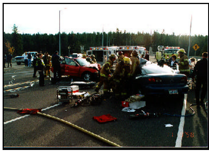
Figure 2. Rescue efforts, facing south

Vehicle 1 was pushed into a counterclockwise rotation and came to rest facing generally west. Vehicle 2