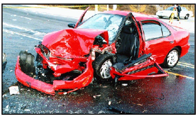
Figure 4. Exterior, Vehicle 1