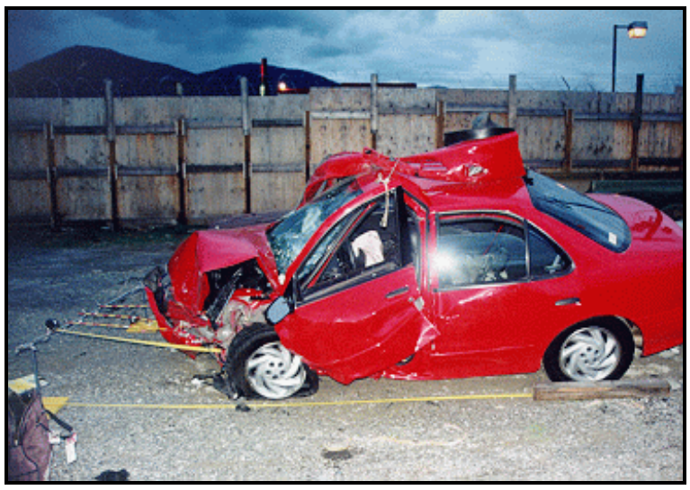
Figure 5. Exterior, Vehicle 1

panel and measured 53 cm wide by 65 cm high. There were no vents or internal tether straps. The single module cover flap opened at the designed tear points and there was no damage to the cover.