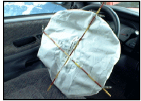
Figure 11. View showing deployed air bag

The driver apparently unbuckled his lap and shoulder belt (post-crash) and exited the left door. He apparently lost his footing as he stepped down onto the pavement and fell onto his right knee. This resulted in a small chip fracture (1cm in diameter) to his patella. The driver was transported to a local hospital where he was treated and released.