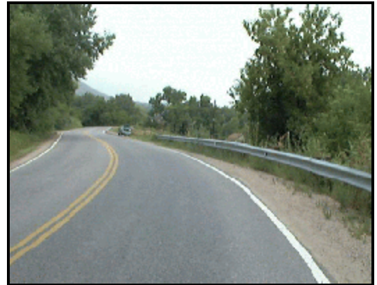
Figure 1. Pre-impact trajectory of Vehicle 1

Vehicle 2, a 1998 Dodge Ram 1500 pickup truck was being driven by a 54 year-old-male (183 cm/ 72 in., 104 kg/ 229 lb.) who was properly wearing the available three-point manual lap and shoulder belt. Driver 2 was proceeding eastbound in lane 1 at a police reported speed of 56 km/h (35 mph). Driver 2 had previously negotiated a sharp right curve and entered a stretch of the roadway that had a slight left curve.