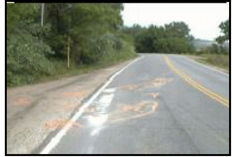
Figure 3. Point of impact and final rest position

The 18 year-old-female driver of Vehicle 1 was killed while the front right seated occupant sustained numerous severe anatomic brain injuries (AIS 3-5), severe thoracic injuries involving numerous fractured ribs, contused lungs with pneumothorax and a lacerated spleen that required a splenectomy. She was hospitalized and survived the crash. The driver of Vehicle 2 (Dodge ram) sustained abrasions and contusions to his left forearm (AIS-1) due to interacting with the depowered driver's air bag. The driver sustained a fractured distal patellar due to falling out of the vehicle (post-impact). Several paramedic units arrived on-scene and transported the passenger in Vehicle 1 to a Trauma Center and the driver of Vehicle 2 was transported to a local Medical Center. Two separate towing agencies arrived on-scene and removed the vehicle's to their respective locations.