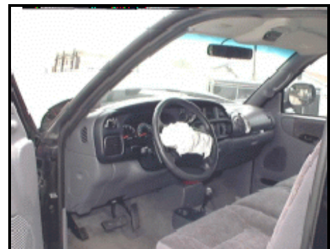
Figure 10. View showing driver's position

The 54 year-old-male driver of the 1998 Dodge Ram 1500 pickup truck was fully restrained and responded to the 12 o'clock direction of force by moving directly forward. He loaded the applied lap belt webbing which prohibited extended forward movement of his lower torso. His upper torso engaged the applied shoulder belt webbing as the driver's air bag deployed. His left forearm was contacted significantly by the deploying air bag which resulted in contusions and abrasions (AIS-1) of his left forearm (ventral aspect) which extended down to the volar region (palm). The driver rebounded into the seatback support which did not result in any additional injuries.