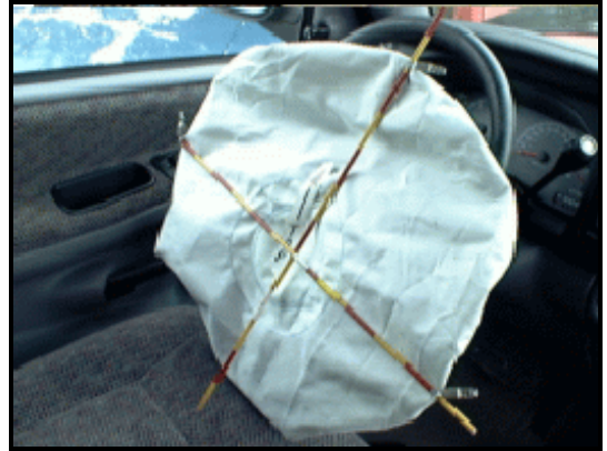
Figure 8. View showing deployed driver's air bag

The front, right passenger air bag is located in the right hand side of the instrument panel (mid-mount) immediately above the glove box door. The single, rectangular module deployment door opened at its designated tear points. Upon deployment, the encased air bag fully deployed. The non-tethered air bag was undamaged and was not equipped with exhaust vent ports.