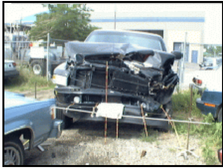
Figure 6. Full frontal view of Vehicle 2 (1998 Dodge Ram)