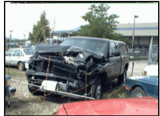
Figure 5. Frontal damage to Vehicle 2 (1998 Dodge Ram 1500)