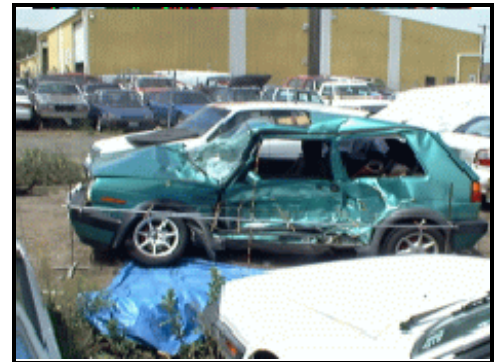
Figure 4. Left side deformation to Vehicle 1 (VW Golf GTI)