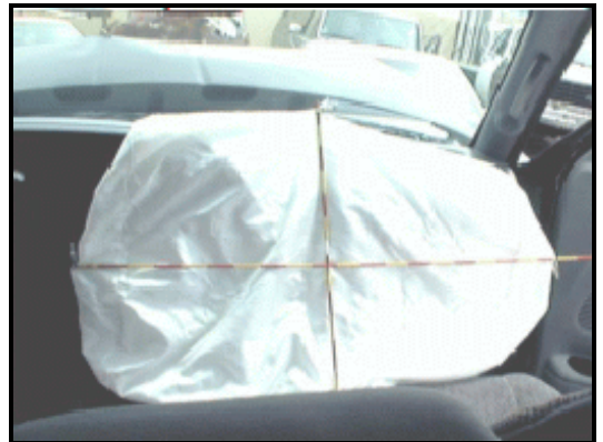
Figure 9. View showing deployed passenger air bag