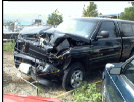
Figure 7. Three-quarter view of Vehicle 2—showing frontal deformation