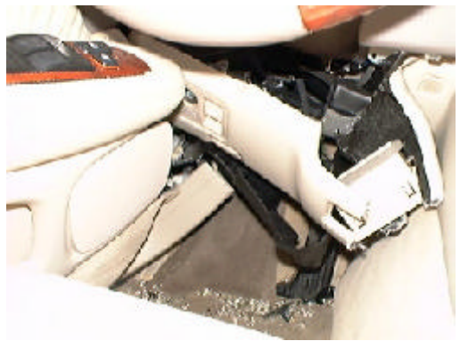
Figure 10 View showing the intrusion of the left side components from the driver's seat looking forward

The manual restraint belt was a continuous loop with an adjustable latching plate. It was designed with a dual mode webbing sensitive/inertia force locking mechanism which activated during the field pull test. The left front latch plate exhibited scratch marks which was indicative of routine belt usage. The driver indicated that she was wearing the restraint belt at the time of the crash and attributed her well being to the performance of the belt system and not to the side impact air bag deployment. The belt did not exhibit any visual impact related evidence of occupant loading. The motorized Dring was adjusted in a mid to bottom adjustment area which was located 4.1 cm (1.625") above the full down position over a measured adjustment range of 9.8 cm (3.875").