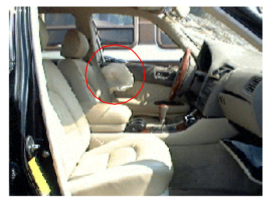
Figure 4 Lateral view of the front seat row of the 1998 Lexus showing the deployed left front side impact air bag