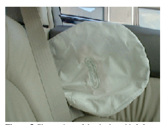
Figure 5 Closer view of the deployed left front side impact air bag

The driver, a 41 year old female who was using the continuous loop manual lap and shoulder restraint belt, suffered a concussion, a fracture of the left clavicle, and contusions of the left side of her body. She was transported via ambulance to a local medical facility where she was treated and released.