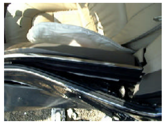
Figure 7 Overhead view of the intrusion in the vicinity of the left front side impact air bag

Interior vehicle damage to the 1998 Lexus LS 400 was attributed to the deployment of the Supplemental Restraint System (SRS) and extensive lateral vehicle intrusion from the first impact sequence with the Dodge 3500 pickup truck ( refer to Figure 7 ). Intruded components included: the left front door armrest; the A-pillar; the left front seat cushion; the left floor sill; the left front door pane; and the left B-pillar ( refer to Figures 8&9 ). The following table lists the intruded values of these components.