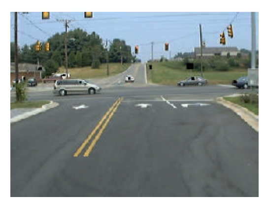
Figure 1 View of the Lexus' northbound trajectory just prior to the point of impact (POI)

This crash involved a 1998 Lexus LS 400 which was traveling north on a business related undivided three lane roadway when it entered a four leg intersection that was controlled by overhead traffic control lights ( refer to Figure 1 ). From the physical evidence at the scene, it appeared that the Lexus had just begun to accelerate from a stopped position when it was struck on the left side by a 1997 Dodge 3500 pickup chassis with a dump body. The Dodge was traveling east in the right lane of a four lane undivided, positive 3.5 percent slope, dry asphalt roadway with a 72 km/h (45 mph) posted speed limit ( refer to Figure 2 ).