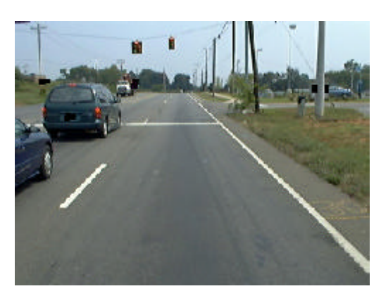
Figure 2 View of the trajectory for the Dodge 30 m from the POI

The frontal plane of the Dodge struck the left side plane of the Lexus at a WinSMASH computed impact speed of 40.9 km/h (25.4 mph). The Lexus sustained direct damage to the left side which began near the left front bumper corner and ended at the rear edge of the driver's door. The maximum crush of 40.6 cm (16.0") was located mid door just below the rearview mirror. The maximum intrusion of the interior side structure in this area measured 33 cm (13"). The generated collision deformation classification code (CDC) was 10-LYAW-3 ( refer to Figure 3 ).