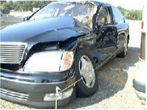
Figure 3 Left front angular corner view of the Lexus illustrating the length of contact and depth of crush

The Lexus was equipped with a supplemental restraint system (SRS) which included dual front air bags and side impact air bags mounted in the outboard aspects of the front seat back supports. The driver's side air bag was the only air bag which deployed during the crash sequence ( refer to Figure 4 ). The side impact air bag was cylindrical in design and deployed forward a measured distance of 27.9 cm (11.0") from the forward leading edge of the seat back support. There was a tether sewn between the inboard and outboard surfaces of the air bag which measured 7.6 cm (3.0") in length. The vertical height of the air bag measured 29.2 cm (11.5") located at the stitching for the tethers ( refer to Figure 5 ). There were no visible contact points on the surface of the air bag.