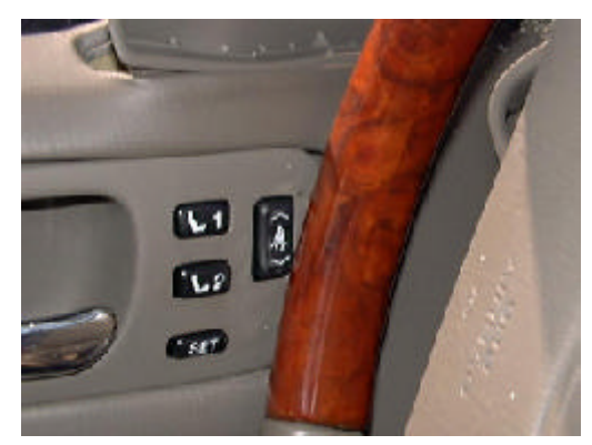
Figure 11 View of the contact evidence on the control pane for the seat positioning

The control switches for the seat memory adjustment and torso belt height adjustment on the left front door showed scuff marks from contact with the lateral aspect of the steering wheel rim as the door panel intruded laterally during the crash ( refer to Figure 10 ). The steering wheel did not exhibit any deformation or loading by the driver.