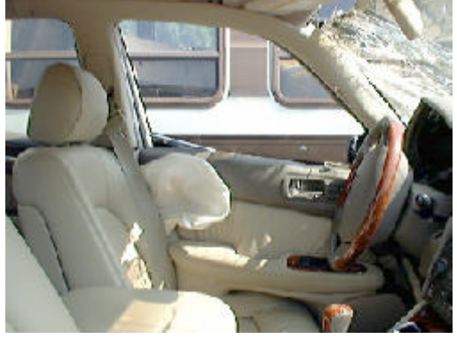
Figure 9 View of the left side of the vehicle illustrating the intruded components