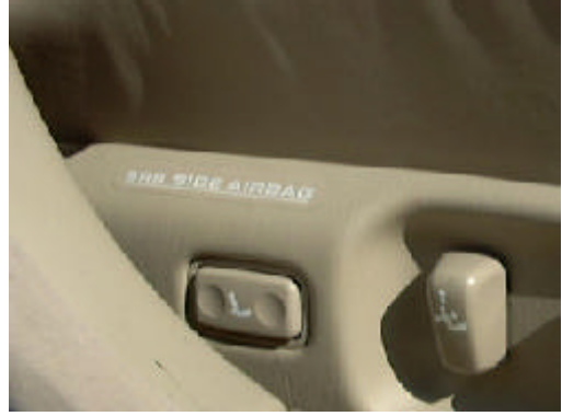
Figure 12 View of the side impact air bag label located above the seat adjustment controls on the outboard surface of the seat

The right front seat was adjusted in the full rear position. A white letter label was attached to the outboard side of the seat just above the seat adjustment controls which read, "SRS SIDE AIRBAG" (refer to Figure 11). The seat back support was reclined 29 degrees.