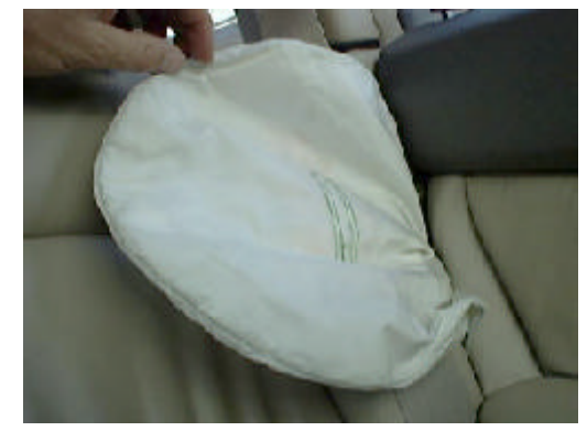
Figure 12 Side surface of the driver's side air bag facing the left front door panel

The air bag was a cylindrical cone shape with the width measuring 25.4 cm (10.0") at the seat back support and 29.2 cm (11.5") at the tether located 14.6 cm (5.75") from the end of the air bag. Stretching the air bag laterally at the tether, the air bag width measured 7.6 cm (3.0"). The longitudinal length of the air bag measured 33.0 cm (13.0"). The tether was secured to the air bag by green colored thread which formed a pattern which measured 2.2 cm (0.875") wide and 8.9 cm (3.5") vertically ( refer to Figure 12 ). The material of the air bag appeared to be a heavy denier with a fine mesh weave. There were no visible vent ports. An inspection