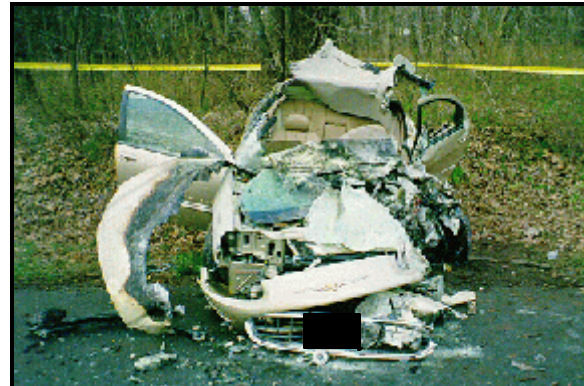
Figure 2: Front left damage to case vehicle; Note: A- and B-pillars cut and roof peeled for extrication; fire damage to hood and windshield (case photo #07)