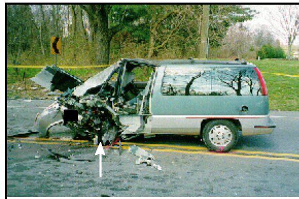
Figure 6: Left side view of vehicle #2's front left damage; Note: post-impact position of left front wheel (arrow) and reduced left front door exit area (case photo #19)

Vehicle #2's driver (41-year-old male; race/ethnicity, height, and weight not known) was reportedly not wearing his available, manual, three-point, lap-and-shoulder safety belt system. He was the sole occupant in vehicle #2. His pre-crash seat adjustments, steering wheel position, and posture are not known. He was found unconscious in his vehicle and was transported from the scene by an unnamed source to a medical facility. He sustained police-reported incapacitating injuries, the most serious of which was internal to the head. Blood samples from vehicle #2's driver yielded a BAC of 0.235%.