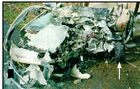
Figure 3: Close-up view of case vehicle's front left damage; Note: post-impact location (arrow) of left front wheel (case photo #08)

The case vehicle did sustain damage from a second impact, to the back or possibly the right rear corner area, when it slid into an embankment on the west roadside. Available police photographs do not provide sufficient coverage of the rear bumper deformation for a valid estimate of a CDC to be attempted, but the damage that is visible suggests the Delta V would be relatively low.