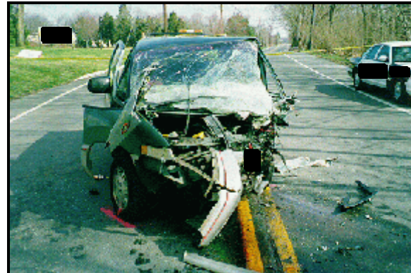
Figure 5: Vehicle #2's front left damage (case photo #16)

Vehicle #2 sustained direct contact damage to the left half of the front plane ( Figure 5 ), including: the front left bumper and fascia displaced rearward; the front grille shattered and missing; the front hood deflected to the right, with the left half sheared off and its left side hinge missing; left half of the front engine compartment bracket housing displaced rearward; left half of the radiator shoved rearward; left front fender missing; left front wheel and tire displaced rearward under the lower A-pillar; the left front door glazing shattered and its sheet metal panel missing; the left upper A-pillar shoved rearward; and the left side of the windshield separated from the left A-pillar and splintered ( Figure 6 ). Based on police photographs, the estimated CDC for vehicle #2 was: 12-FYAW-6 (direction of principal force 350 (-10) degrees). The WinSMASH reconstruction program, with a CDC-only estimated crush profile, provided a borderline reconstruction, but the results appear reasonable. Vehicle #2's estimated Total, Longitudinal, and Lateral Delta Vs are, respectively: 68.8 km.p.h. (42.8 m.p.h.), -67.7 km.p.h. (-42.1 m.p.h.), and 11.9 km.p.h. (7.4 m.p.h.).