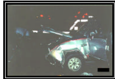
Figure 6. Exterior damage to the Dodge pickup truck

The 1989 Dodge pickup truck sustained moderate frontal damage as a result of the impact with the Sunfire. On-scene photographs provided the basis for exterior damage of the vehicle (Figure 6). The Collision Deformation Classification (CDC) for the impact with the Sunfire was 12-FDEW-2. The direct contact damage involved the entire frontal width of the vehicle. The direct contact damage extended vertically from the bumper to the face of the hood. The front bumper was displaced rearward and downward from the override to the Sunfire. The left front wheel was restricted from the rearward displacement of the left fender. Six crush measurements were estimated at the level of the bumper reinforcement beam and were as follows: C1: 40 cm (16"), C2: 40 cm (16"), C3: 35 cm (14"), C4: 30 cm (12"), C5: 25 cm (10"), C6: 20 cm (8").