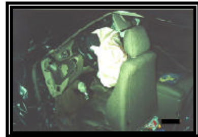
Figure 5. Interior view of the Pontiac Sunfire

The interior of the Chevrolet Cavalier sustained moderate damage that was associated with exterior deformation and driver contact ( Figure 5 ). The left instrument panel intruded into the driver's compartment due to rearward displacement of the left A-pillar. The left toe pan displaced approximately 10-12" rearward to a near vertical position. The unrestrained driver initiated a forward trajectory and loaded the steering assembly through the redesigned air bag. Her loading force deformed the upper and lower aspects of the steering wheel rim and probably compressed the energy absorbing steering column. This was evident by the close proximity of the steering wheel rim to the instrument panel. The driver's knees contacted and deformed the plastic knee bolster directly below and to the left of the steering column. Scuff marks identified both knee strikes to the bolster panel.