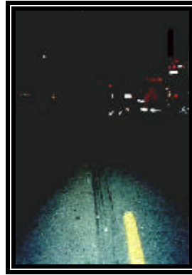
Figure 2. Skid mark from Dodge pickup truck

The 62-year-old female driver of the 1998 Pontiac Sunfire was operating the vehicle eastbound on a two-lane state roadway. The vehicle crossed the centerline for an unknown reason and traveled into the westbound lane prior to entering the intersection and into the path of the Dodge pickup truck. The driver of the pickup truck realized the impending harmful event, applied the brakes and attempted to steer left. Approximately 9m (30') of pre-impact skid marks from the pickup truck's left front tire were noted in the on-scene photographs ( Figure 2 ).