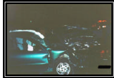
Figure 1. On-scene photograph showing vehicle final rest positions

This remote investigation focused on a two-vehicle crash that involved a 1998 Pontiac Sunfire coupe (subject vehicle) and a 1989 Dodge Ram pickup truck ( Figure 1 ). The Sunfire was occupied by a 62-year-old female driver and her 12-year-old grandson seated in the front right position. The front right passenger was restrained by the manual 3-point lap and shoulder belt system, however the driver was unrestrained. The Sunfire was traveling eastbound on a two lane state highway when it crossed the centerline into the path of the westbound Dodge pickup truck. The full frontal area of the Sunfire underrode the front of the pickup truck resulting in a 12/12 o'clock impact configuration. The unrestrained driver of the Sunfire was seated in close proximity to the steering wheel and probably submarined the steering column and struck the knee bolster. She was probably struck by the expanding redesigned driver's air bag in the chest and rebounded rearward. She sustained fatal internal injuries and was pronounced dead at the scene. The front right passenger loaded the manual restraint and the deployed redesigned air bag, and sustained incapacitating injuries. He was flown by helicopter to a local hospital and admitted.