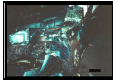
Figure 4. Close-up of front left damage to the Pontiac Sunfire