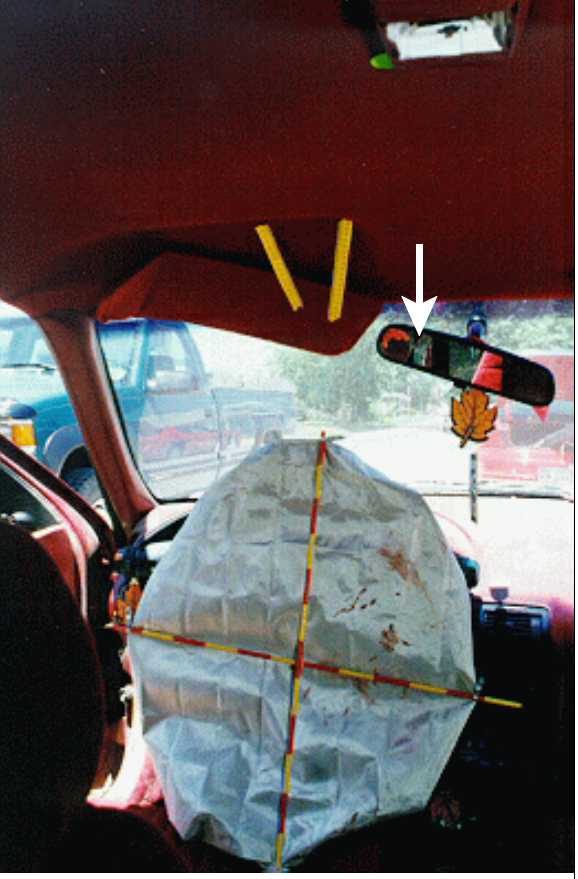
Figure 10: Vertical view of case vehicle's driver seating area showing cracked (arrow) rearview mirror, probable occupant contact to sun visor, and blood evidence on driver air bag (case photo #28)

An examination of the case vehicle's interior revealed that the rearview mirror was askew (Figure 10), most likely from contact by the driver's hand as her hand was propelled upwards during the air bag's inflation. In addition, the energy absorbing steering column showed significant evidence of compression; although, the steering wheel rim showed no apparent deformation. The shear capsules were separated a measured distance of 5.5 centimeters (2.2 inches). The driver's sun visor and roof above the sun visor showed evidence of skin transfers ( Figure 10 ). The top of the instrument panel, just above and to the right of the steering wheel rim, had what appeared to be four finger imprints from the case vehicle's driver (Figure 11). Further, the left side of the driver's knee bolster was scuffed and indented from contact with the driver's left knee. And finally, the driver air bag module's