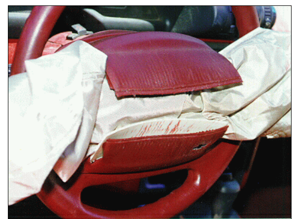
Figure 12: Close-up of cloth transfers deposited on case vehicle driver air bag module's cover flaps; Note: edge of top cover flap struck driver in upper right anterior neck (case photo #22)

Based on the vehicle inspection the CDC for the case vehicle was determined to be: 12-FREN-1 (0) [residual maximum crush was 6 centimeters (2.4 inches) and was located between C_5 and C_6 ]. The WinSMASH reconstruction program, barrier algorithm, was used on the case vehicle's highest severity impact, bearing in mind the yielding object nature of this impact. The maximum Total, Longitudinal, and Lateral Delta Vs are, respectively: 12.0 km.p.h. (7.5 m.p.h.), -12.0 km.p.h. (-7.5 m.p.h.), and 0.0 km.p.h. (0.0 m.p.h.).