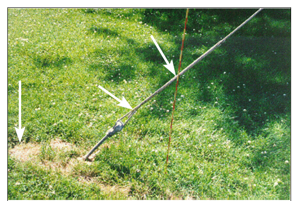
Figure 6: Close-up of guy wire impacted by case vehicle; Notes: left arrow highlights location of guy wire post-impact; guy wire was partially uprooted from ground by impact and was subsequently reburied; center arrows show width of damage on guy wire from impact with case vehicle (case photo #06)