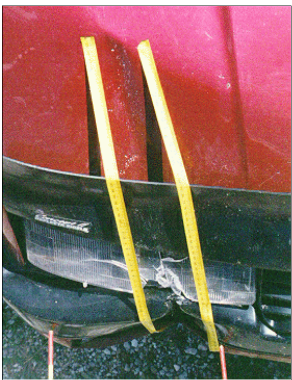
Figure 9: Overhead close-up of deformation to case vehicle's front right bumper, bug deflector, and hood from impact with guy wire (case photo #16)

deformed with the hood and grille also being deformed rearward. The case vehicle's wheelbase remained unchanged from the crash.