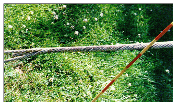
Figure 7: Close-up of guy wire section damaged by impact with case vehicle (case photo #07)

The case vehicle was a front wheel drive 1991 Chevrolet Corsica LT, five-passenger, four-door sedan (VIN: 1G1LT53G3MY-----) equipped with power-assisted, rack-and-pinion steering, a 2.2L, TBI, L-4 engine, and a three-speed automatic transmission. Braking was