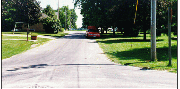
Figure 2: Case vehicle's travel path through the four-leg intersection and off the west (right) side of the road toward the guy wire (case photo #03)

The crash occurred off the southwest corner of the intersection (see CRASH DIAGRAM below). The measured distance from the driveway to the point of impact was 23.2 meters (76 feet).