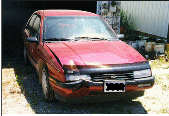
Figure 4: Case vehicle's frontal damage from impact with guy wire viewed from right of front (case photo #10)