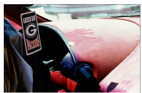
Figure 11: Right hand print deposited on dash by case vehicle's driver when she loaded the steering column during the crash sequence (case photo #31)