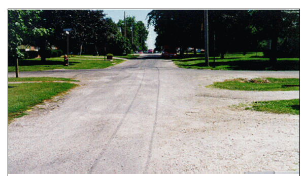
Figure 1: Case vehicle's intended travel path southward as she began to accelerate forward after backing out of driveway (case photo #01)

The case vehicle had just backed out of her driveway (i.e., an eastward to northward backing maneuver) onto a two-lane, undivided, city street and was heading south, intending to continue traveling south. The driveway (on the west side of the roadway) was just north of a partially controlled four-leg intersection. At the time of the crash the case vehicle's driver was under the influence (i.e., 0.19 mg/dl according to her emergency room records) and upset after an argument with her boyfriend. Possibly as a result she accelerated forward in the southbound lane (Figure 1) through the intersection but subsequently drove off the southwest corner of the four-leg intersection, narrowly missing a utility pole (Figure 2). The case vehicle continued in a south-southwesterly direction off the roadway an additional 7.4 meters (24.4 feet). vehicle's driver made no known avoidance maneuvers prior to the crash (Figure 3 below).