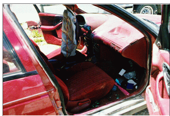
Figure 8: Case vehicle's front seating area, view from right front door, showing deployed driver (only) air bag (case photo #33)

achieved by a power-assisted, four wheel disc braking system. The case vehicle was not equipped with anti-lock brakes. The case vehicle's wheelbase was 263 centimeters (103.4 inches), and the odometer reading at inspection was 144,561 kilometers (89,826 miles).