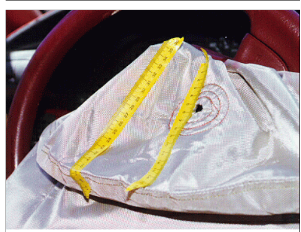
Figure 14: Close-up of skin transfer to backside of case vehicle's driver air bag (case photo #27)