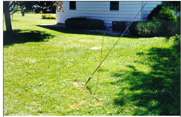
Figure 3: Guy wire impacted by case vehicle which was located off the west (right) side of the road (case photo #05)

The case vehicle's front right bumper ( Figures 4 and 5 ) impacted a guy wire used to support a utility pole ( Figures 6 and 7 below) and momentarily continued forward prior to reaching maximum engagement which caused the case vehicle's driver (only) supplemental restraint (air bag) to deploy. At maximum engagement, the case vehicle's front right snagged on the guy wire, and the case vehicle rotated approximately 35 degrees clockwise coming to rest primarily off the west side of the road on the grass heading southwest. The case vehicle was towed from the scene but not due to damage.