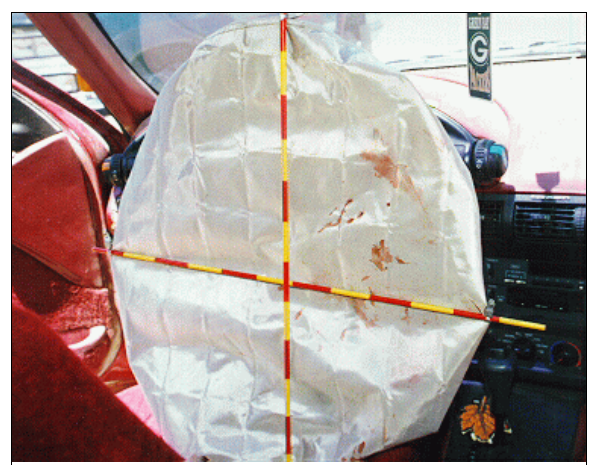
Figure 13: Case vehicle's driver air bag with blood evidence to bottom half; Note: steering wheel turned 90 degrees counterclockwise (case photo #25)

Fifty-nine (59) days post-crash a General Motors (GM) analyst inspected the case vehicle and downloaded information that was recorded on the case vehicle's Diagnostic Energy Reserve Module (DERM). The DERM revealed that the system was clean (i.e., no faults or warning codes) at the time of the deployment. According to GM, the case vehicle had a early version of the DERM, and this version was not capable of recording the maximum Delta V that the case vehicle sustained. The location of the DERM is unknown. For additional information, see the DIAGNOSTIC ENERGY RESERVE MODULE section below.