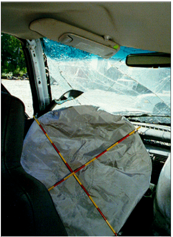
Figure 13: Vertical view of case vehicle's driver seating area and deployed air bag showing contact evidence near center of air bag; Note: intrusion to "A"-pillar and air bag exhaust residue on sun visor (case photo #23)

vertically. An inspection of the air bag module's cover flaps and air bag revealed that the cover flaps opened at the designated tear points, and there was no evidence of damage during the deployment to the air bag or the cover flaps. The cover flap, however, was pushed through the steering wheel rim during the deployment, most likely from loading to the air bag's fabric by the driver which caused the air bag to expand towards the left instrument panel. The driver's air bag was designed with four tethers, each approximately 6 centimeters (2.4 inches) in width. The driver's air bag had one vent port, approximately 2.5 centimeters (1.0 inches) in diameter, located at the 12 o'clock position. The deployed driver's air bag was round with a diameter of 59 centimeters (23.2 inches). An inspection of the driver's air bag fabric revealed two areas of skin-a smaller area to the center of the air bag and a larger area in the lower right quadrant. It should be noted that the top of the steering wheel had been rotated to the 5 o'clock position at time of inspection. The small area measured 4 x 2 centimeters (1.6 x 0.8 inches) and the larger area measured 9 x 4 centimeters (3.5 x 1.6 inches). There was also a faint red lipstick mark on the air bag's fabric ( Figure 13 ).