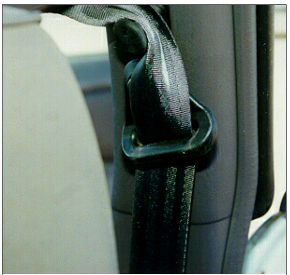
Figure 16: Close-up of "D"-ring from case vehicle's front right safety belt showing trace evidence of loading (case photo #41)

and latch plate showed some trace evidence of loading on the "D"-ring ( Figure 16 ); however, there was no evidence (i.e., loading or blood) on the safety belt's webbing ( Figure 17 ).