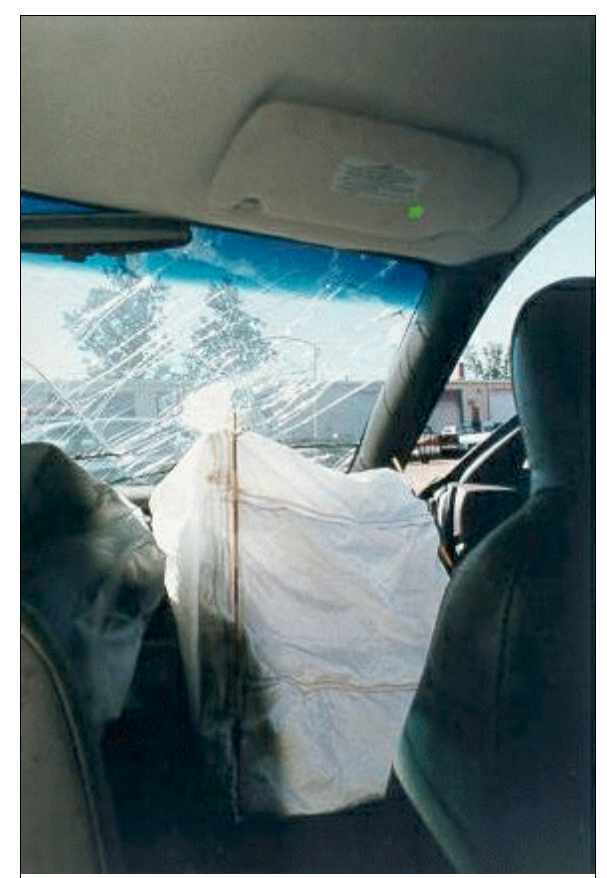
Figure 8: Case vehicle's front right passenger seating area showing deployed front right passenger air bag, tow yard damage to right windshield's glazing and either mucous spray or bag exhaust residue on front right sun visor (case photo #26)

Inspection of the case vehicle's interior revealed a cracked windshield and a disintegrated driver's door window glazing from the direct contact to the left "A"-pillar and the driver's door. The rearview mirror was also askew from contact with the deploying front right passenger air bag. There was evidence, possibly mucous spray, on both the driver and the front right (Figure 8) sun Furthermore, there were scuffs and indentation to the driver's knee bolster and on the right side of the steering column (Figure 9 below). There was also evidence of occupant contact on the interior surfaces of the case vehicle's center instrument panel, glove box door (Figures 9 and 10 below), and both front seat backs (Figures 11 and 12 below). There was greater than 15 centimeters (5.9 inches) of intrusion to the left "A"-pillar and left front door panel areas with less than 15 centimeters (5.9 inches) of intrusion to the front left toe pan, left instrument panel, driver's seat back, and front right passenger's seat back. The energy absorbing steering column showed no evidence of compression; although, because of the amount of intrusion, it was slightly tilted to the right.