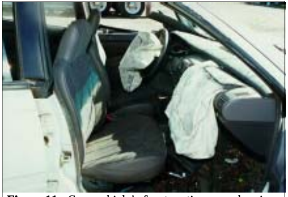
Figure 11: Case vehicle's front seating area showing deployed driver and front right passenger air bags; Note: both front seat backs deformed by passenger impacts from rear (case photo #32)