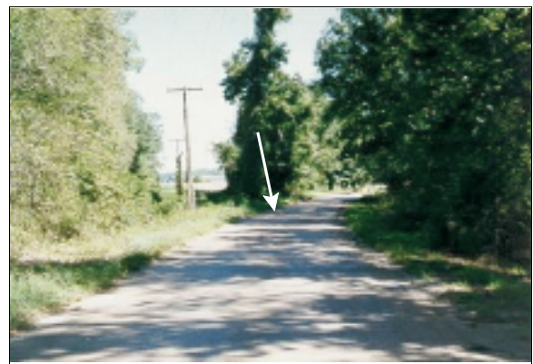
Figure 2: Sunbird's easterly travel path in right-hand curve; Note: arrow marks approximate point of impact (case photo #06)

The county roadway was curved slightly to the left for westward traffic and level (i.e., actual slope was less than 1.0%, negative to the west) at the area of impact. The pavement was bituminous, and the width of the roadway was 5.5 meter (18.2 feet). The shoulders were not improved (i.e., vegetation). No pavement markings or edge lines were present. The estimated coefficient of friction was 0.80. There were no visible traffic controls. The statutory speed limit was 72 km.p.h. (45 m.p.h.) and no regulatory speed limit sign was posted near the crash site. At the time of the crash the light condition was dark, the atmospheric condition was clear, and the road pavement was dry. There was no other traffic present, and the site of the crash was rural undeveloped.