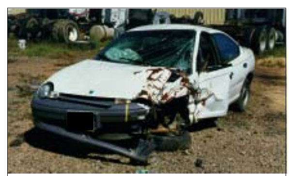
Figure 4: Case vehicle's narrow front left damage pattern viewed from left of front; Note: direct damage extends to left "A"-pillar and driver's door (case photo #13)