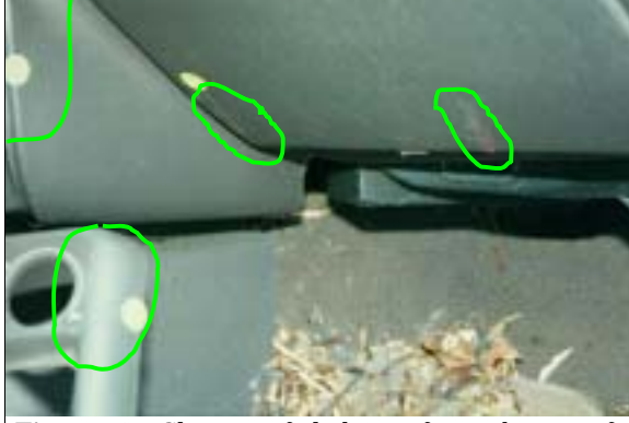
Figure 10: Close-up of cloth transfers to bottom of case vehicle's glove box door; Note: deformation to right side of center instrument panel (case photo #31)