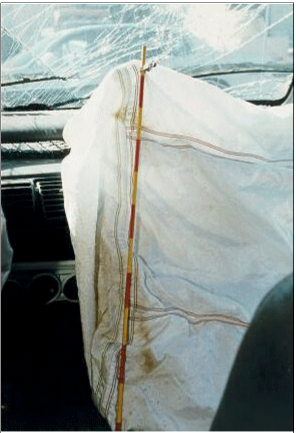
Figure 15: Close-up of case vehicle's deployed front right passenger air bag showing bloody discoloration along left side surface (case photo #38)