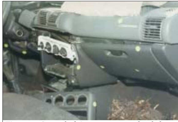
Figure 9: Case vehicle's instrument panel and glove box door showing deployed front right passenger's air bag and contact evidence around steering column, on center instrument panel and right glove box door (case photo #30)

Based on the vehicle inspection, the CDC for the case vehicle was determined to be: 12-FLAE-6 (350) . The WinSMASH reconstruction program was not used on the case vehicle's highest severity impact because this crash involved a narrow corner impact and there was no common velocity achieved during the crash; however, this contractor's visually estimated Delta V is between 19 km.p.h. (12 m.p.h.) and 26 km.p.h. (16 m.p.h.). The case vehicle was towed due to damage.