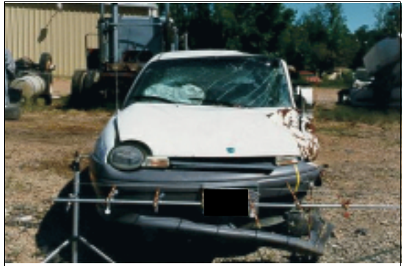
Figure 3: Case vehicle's very narrow front left corner damage; Note: yellow tape marks rightward extend of direct damage (case photo #09)

The county roadway was curved slightly to the left for westward traffic and level (i.e., actual slope was less than 1.0%, negative to the west) at the area of impact. The pavement was bituminous, and the width of the roadway was 5.5 meter (18.2 feet). The shoulders were not improved (i.e., vegetation). No pavement markings or edge lines were present. The estimated coefficient of friction was 0.80. There were no visible traffic controls. The statutory speed limit was 72 km.p.h. (45 m.p.h.) and no regulatory speed limit sign was posted near the crash site. At the time of the crash the light condition was dark, the atmospheric condition was clear, and the road pavement was dry. There was no other traffic present, and the site of the crash was rural undeveloped.