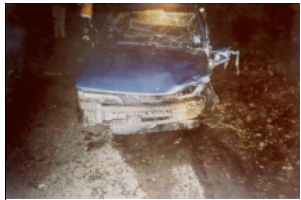
Figure 5: On-scene view of Pontiac Sunbird's front left damage from impact with case vehicle (case photo #43)

( Figure 5 ) of the Pontiac. As the Pontiac traveled down the case vehicle's left side, it snagged the case vehicle's left front wheel assembly, causing the case vehicle's driver and front right passenger supplemental restraints (air bags) to deploy late during the duration of the impact. The case vehicle rotated approximately 90 degrees counterclockwise and came to rest straddling the middle of the roadway, heading in a southerly direction. The Pontiac rotated approximately 200 degrees counterclockwise and came to rest primarily in the westbound lane, heading in a southwesterly direction.