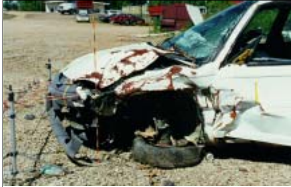
Figure 7: Case vehicle's very narrow frontal impact showing deformation down left side; Note: yellow tape indicates length of direct contact (case photo #10)

"A"-pillar and driver's door ( Figure 7 ). Direct contact was measured as 175 centimeters (68.9 inches). Residual maximum crush was measured as 32 centimeters (12.6 inches) at C<sub>1</sub>. The case vehicle's left front wheel was torn away from the axle. The wheelbase on the case vehicle's left side was shortened an estimated 17 centimeters (6.7 inches) while the right side was extended approximately 4 centimeters (1.6 inches). The driver's window glazing was disintegrated from direct contact to the left "A"-pillar and driver's door. The case vehicle's front bumper, bumper fascia, grille, hood, and left headlight and turn signal assemblies, left fender, and left front door