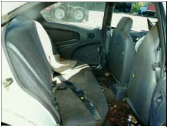
Figure 12: Case vehicle's back seating area; Note: deformed front seat backs from contact by back seat passengers (case photo #32a)