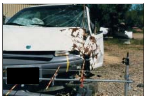
Figure 6: Case vehicle's very narrow front left corner damage viewed down left side (case photo #12)

The case vehicle's contact with the Pontiac involved its front left corner ( Figures 3 and 4 above). Direct damage began 48 centimeters (18.9 inches) left of center and extended 20 centimeters (7.9 inches) to the front left bumper corner ( Figure 6 ). This narrow corner engagement extended down the left side to the left