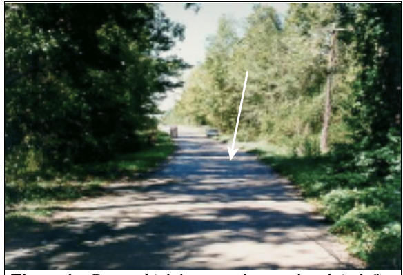
Figure 1: Case vehicle's westerly travel path in left-hand curve; Note: arrow marks approximate point of impact (case photo #02)

The case vehicle was traveling west-southwest in the westbound lane of a two-lane, undivided, county road and intended to continue traveling westward ( Figure 1 ). The Pontiac was in the process of exiting a right-hand curve on the same, two-lane, undivided roadway when the Pontiac entered the westbound lane ( Figure 2 ). The Pontiac's driver, who was intoxicated according to the Police Crash Report, had intended to continue traveling east-northeastward in the eastbound lane. The case vehicle's driver steered to the right and braked, attempting to avoid the crash. The crash occurred in the westbound lane of the roadway; see Crash Diagram below.