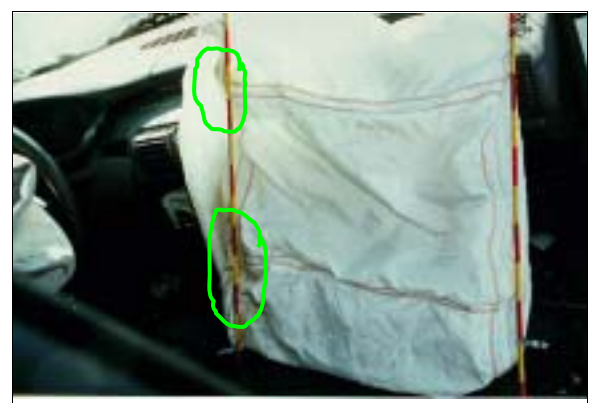
Figure 14: Case vehicle's deployed front right air bag; Note: highlighted discolored areas (case photo #36)

discoloration—most likely dried blood, on the air bag's fabric along the left edge at the top and bottom corners ( Figure 14 and Figure 15 ). No visible skin transfers were found. The upper area was 8 \times 5 centimeter ( 3.1 \times 2.0 inches) and located on the left side surface at upper front corner. The second area was on lower left corner of the front surface and measured approximately 10 \times 3 centimeters ( 3.9 \times 1.2 inches). In addition, there was an very small area of unknown substance to the front lower right corner.