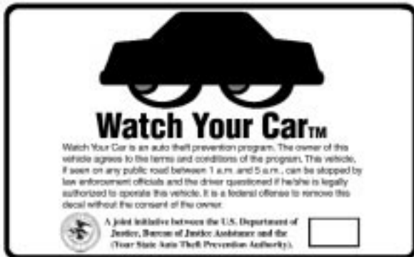
Figure 1. Front windshield decal

The rear window decal depicted in figure 2 contains no written information but simply serves as a beacon to law enforcement officers that the vehicle is registered in the Watch Your Car Program.