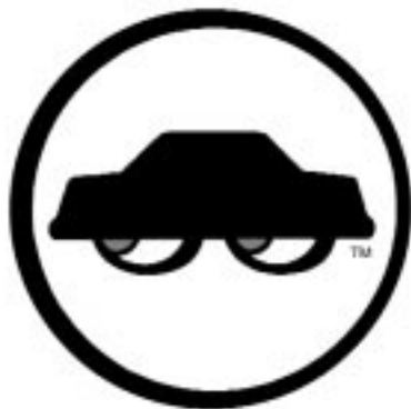
Figure 2. Rear window decal

Motorists can have the decal depicted in figure 3 applied next to the decal for the early morning hours program. This is the international borders/ports decal and is highly visible to border inspectors and law enforcement personnel who monitor traffic at border crossings and ports.