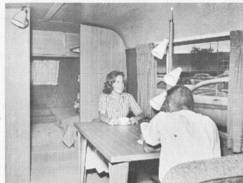
View toward rear right. Bedroom at rear.