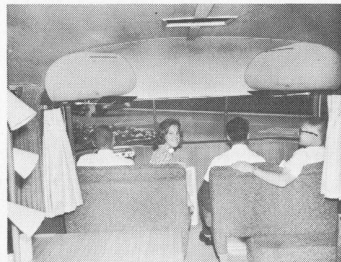
Large windshield incorporates Chevrolet step-van wrap-around sections.

The GO-HOME is a self-propelled, high performance complete mobile home which the average person can afford to buy and to operate.