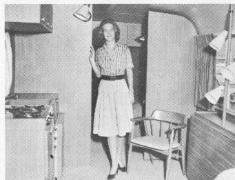
Kitchenette includes, oven, broiler, gas refrigerator.